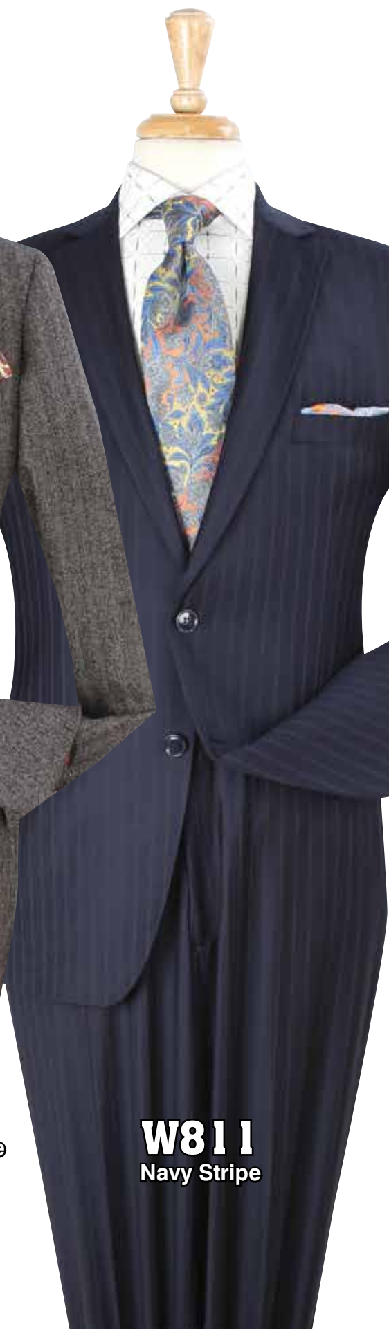
W811 Navy Stripe