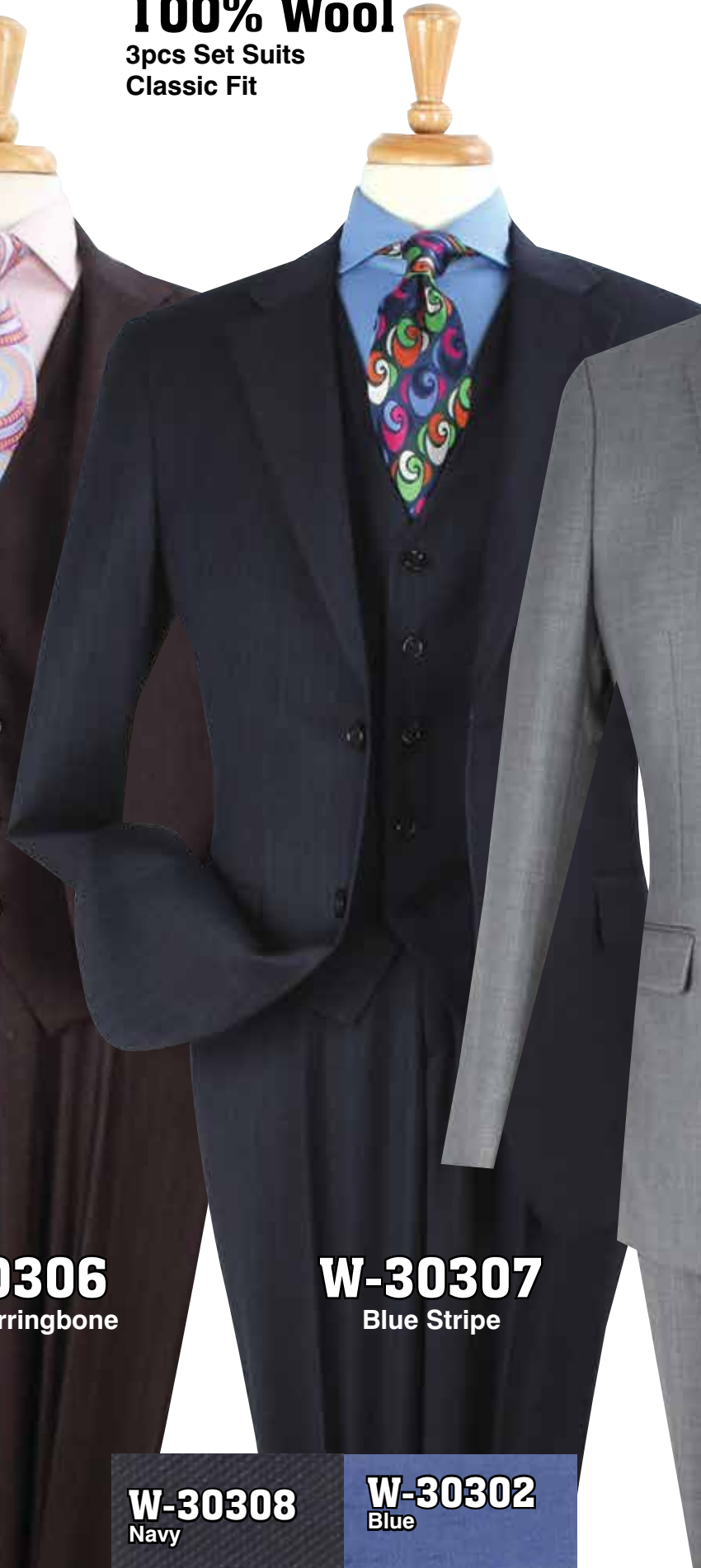
W-30307 Blue Stripe