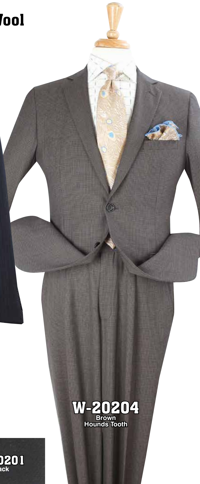
W-20204 Brown Hounds Tooth