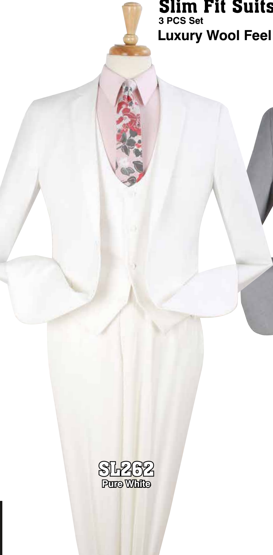
SL262 Pure White