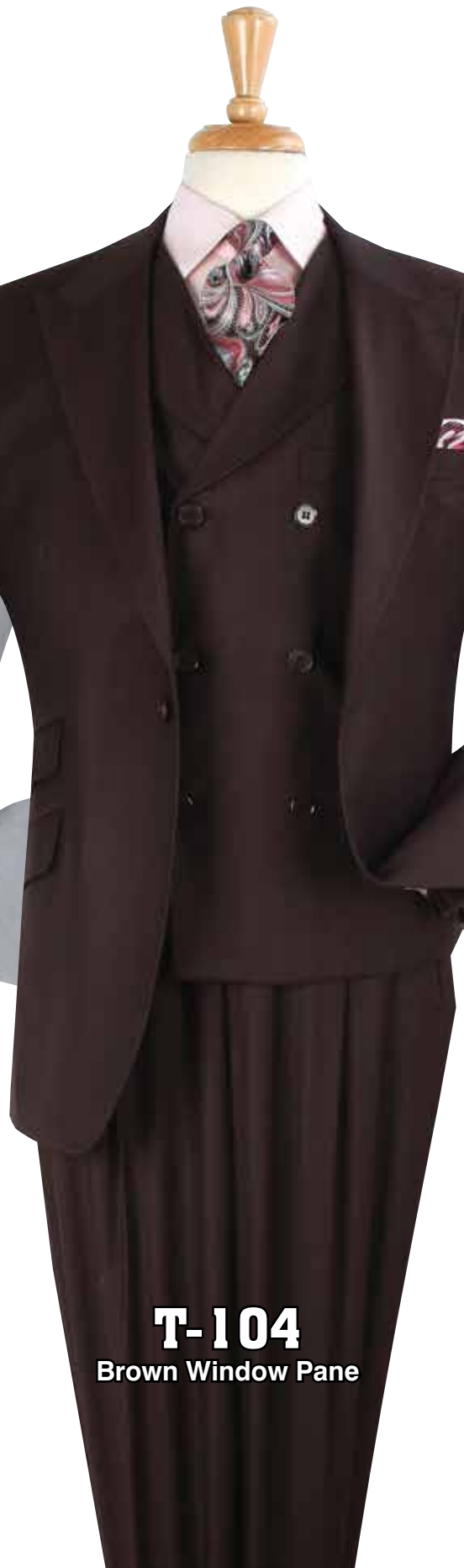
T-104 Brown Window Pane