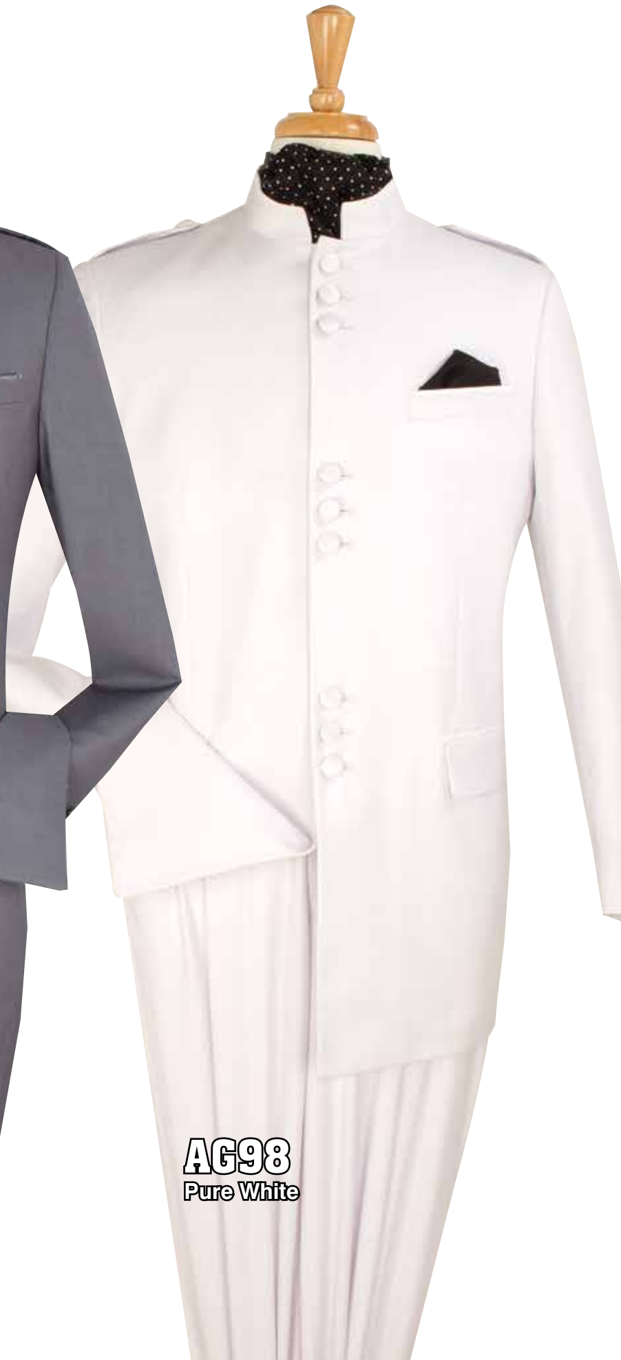
AG98 Pure White