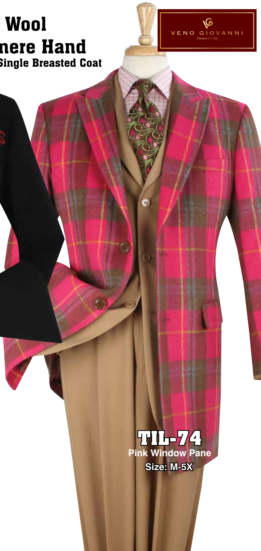
TIL-74 Pink Window Pane Size: M-5X