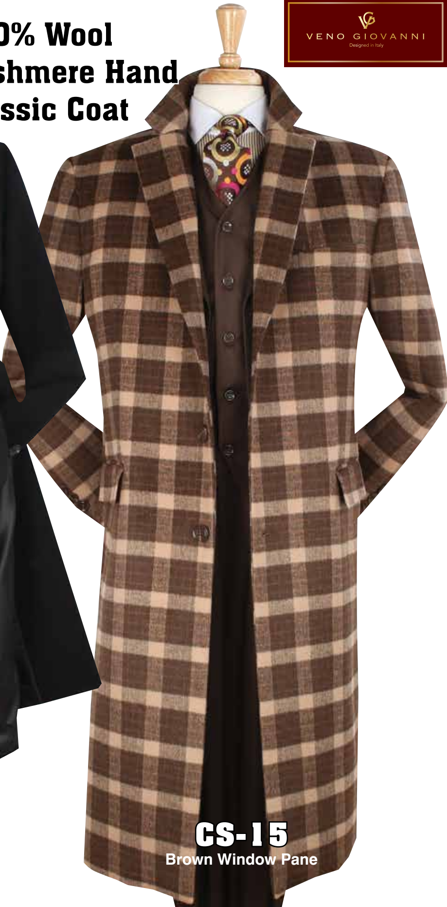
CS-15 Brown Window Pane