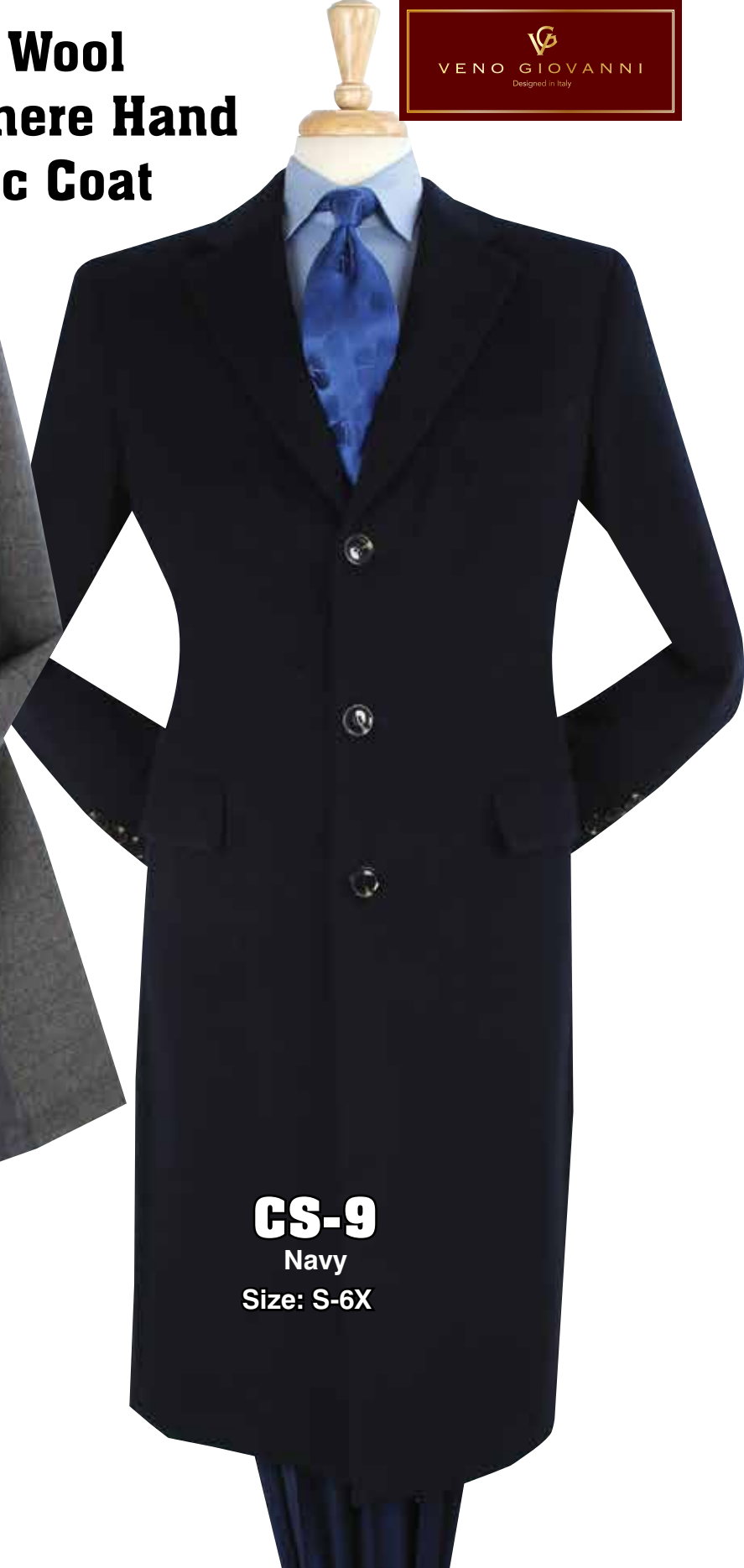
CS-9 Navy Size: S-6X