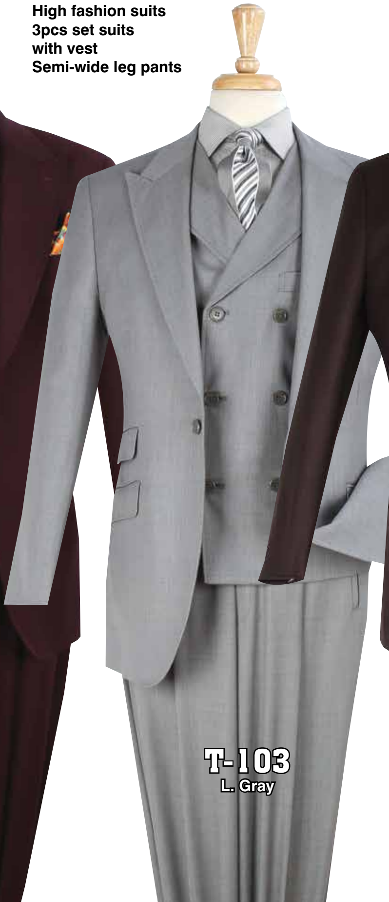
T-103 L. Gray