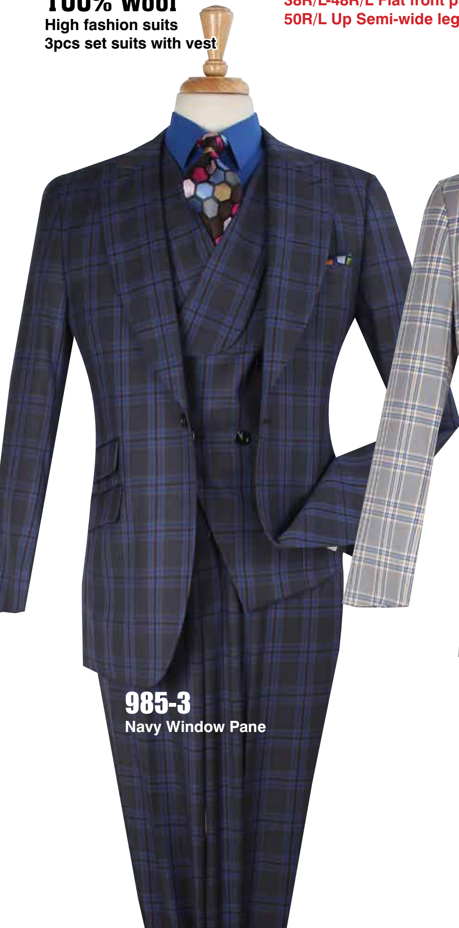
985-3 Navy Window Pane