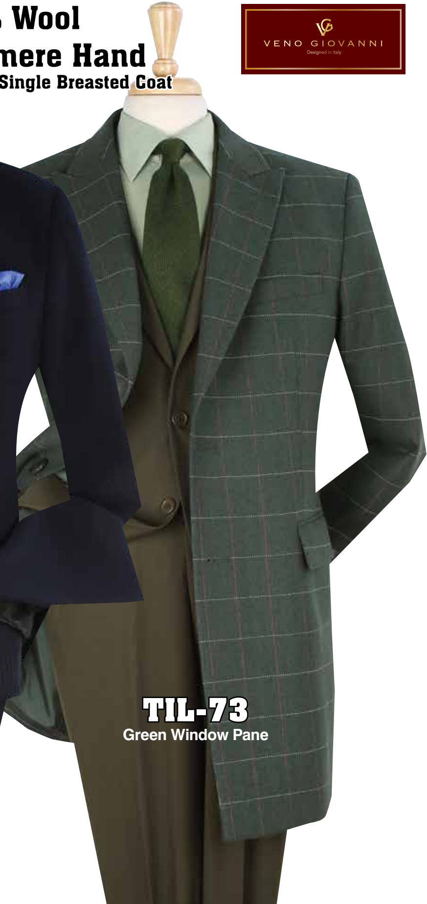
TIL-73 Green Window Pane