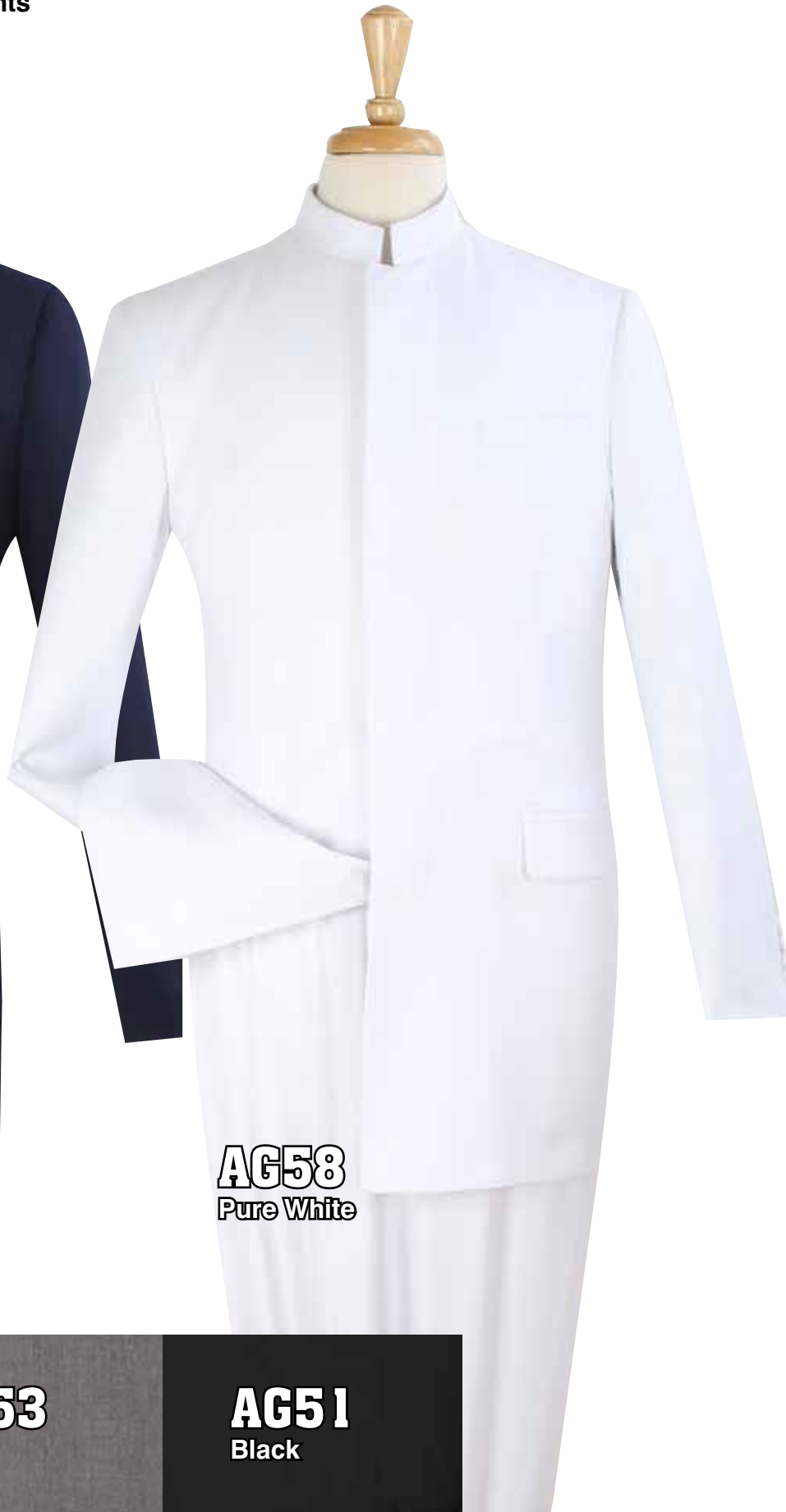
AG58 Pure White