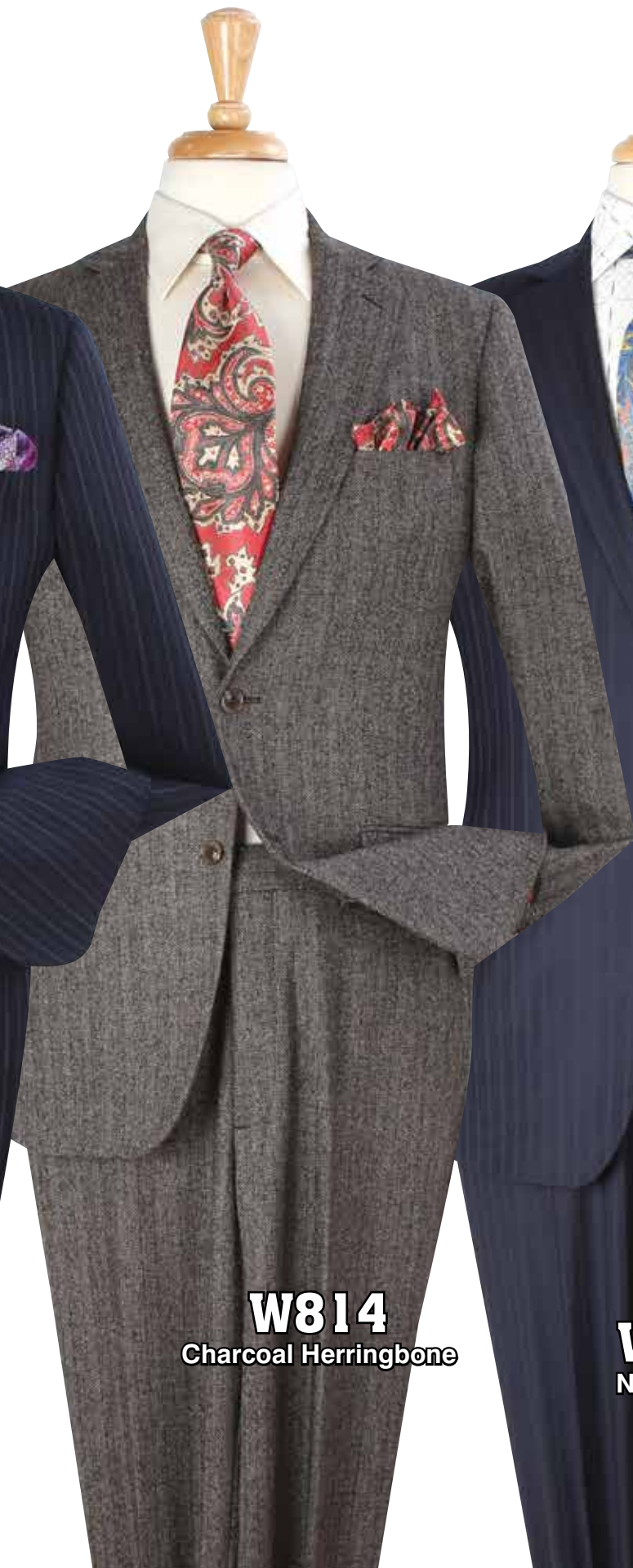
W814 Charcoal Herringbone