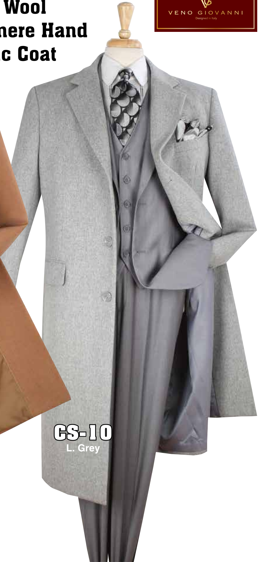
CS-10 L. Grey