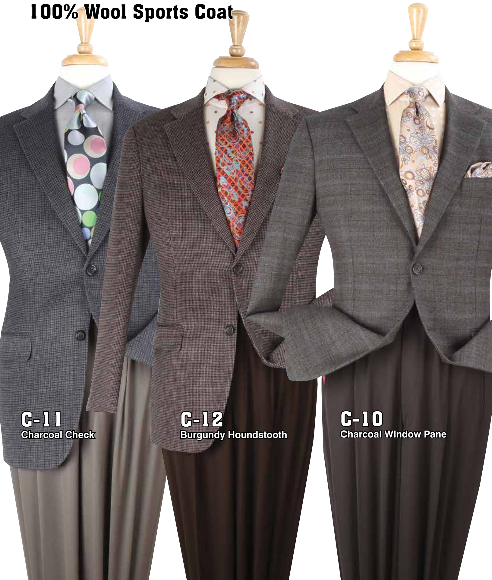
C-11 Charcoal Check