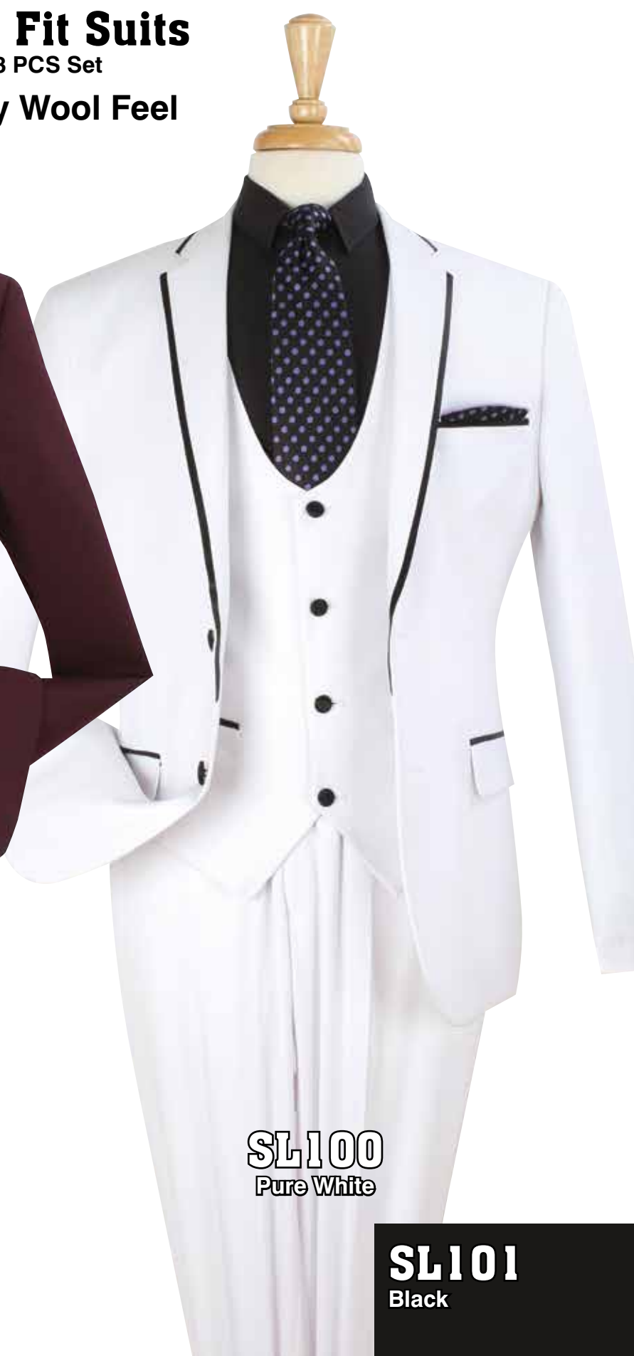
SL100 Pure White