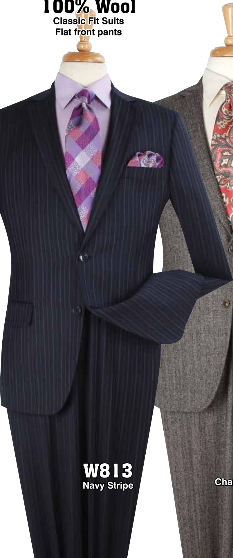
W813 Navy Stripe