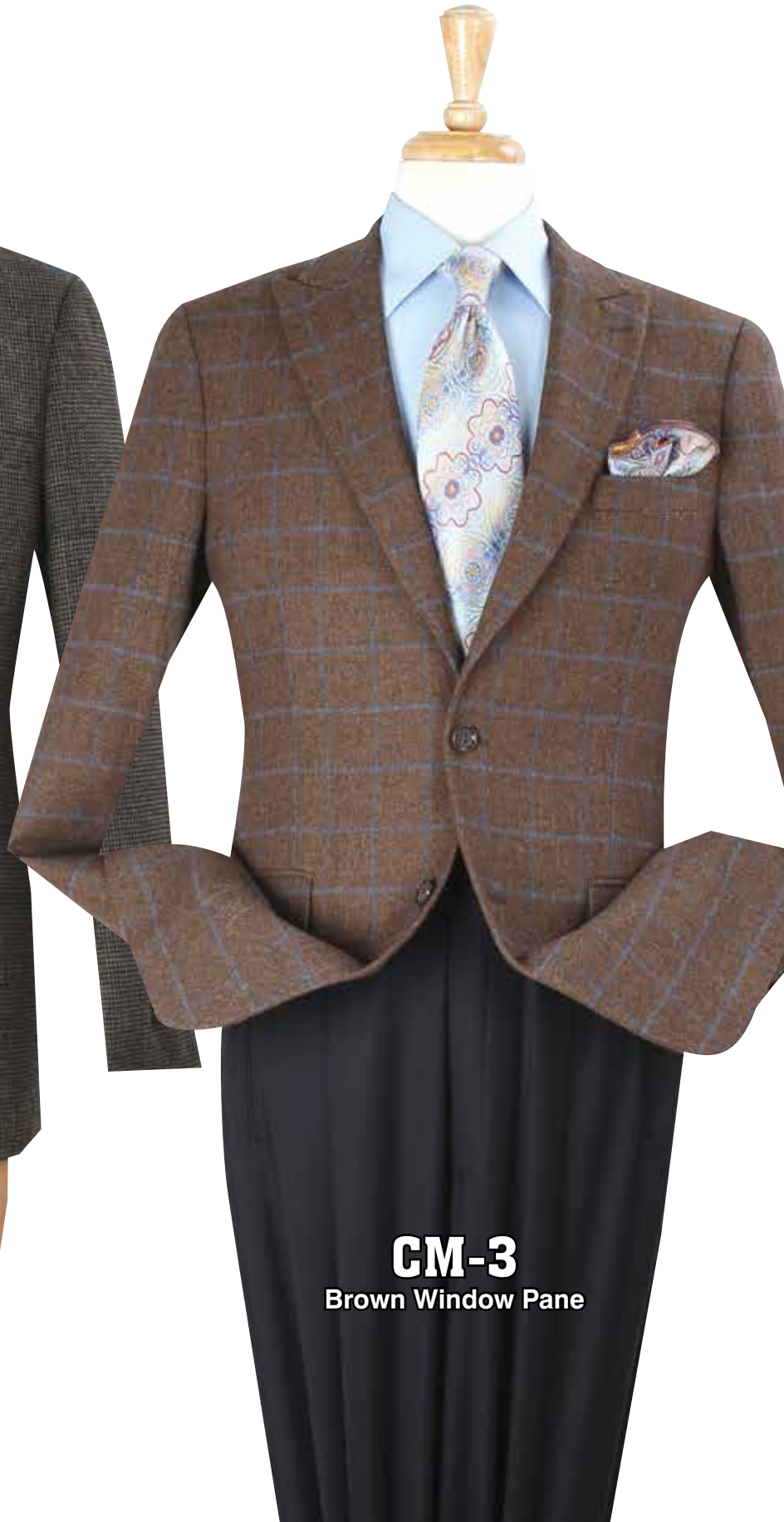
CM-3 Brown Window Pane