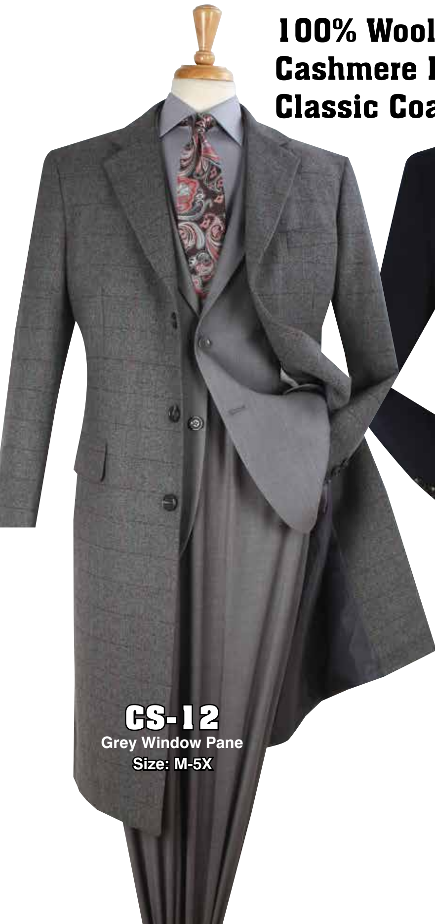
CS-12 Grey Window Pane Size: M-5X