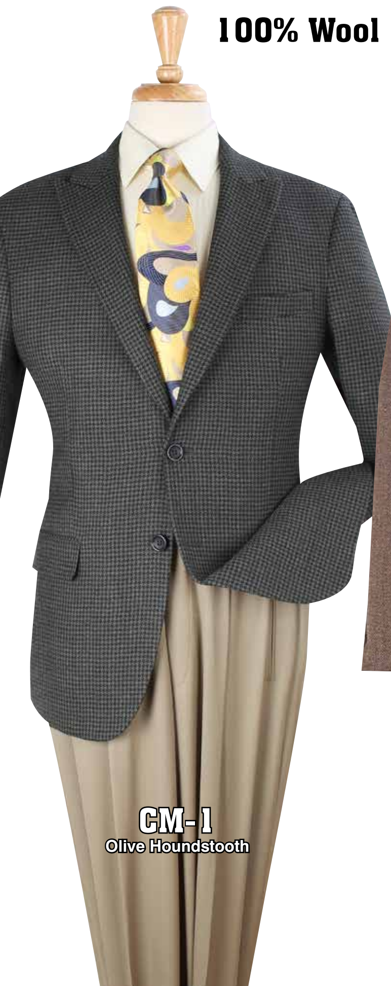
CM-1 Olive Houndstooth