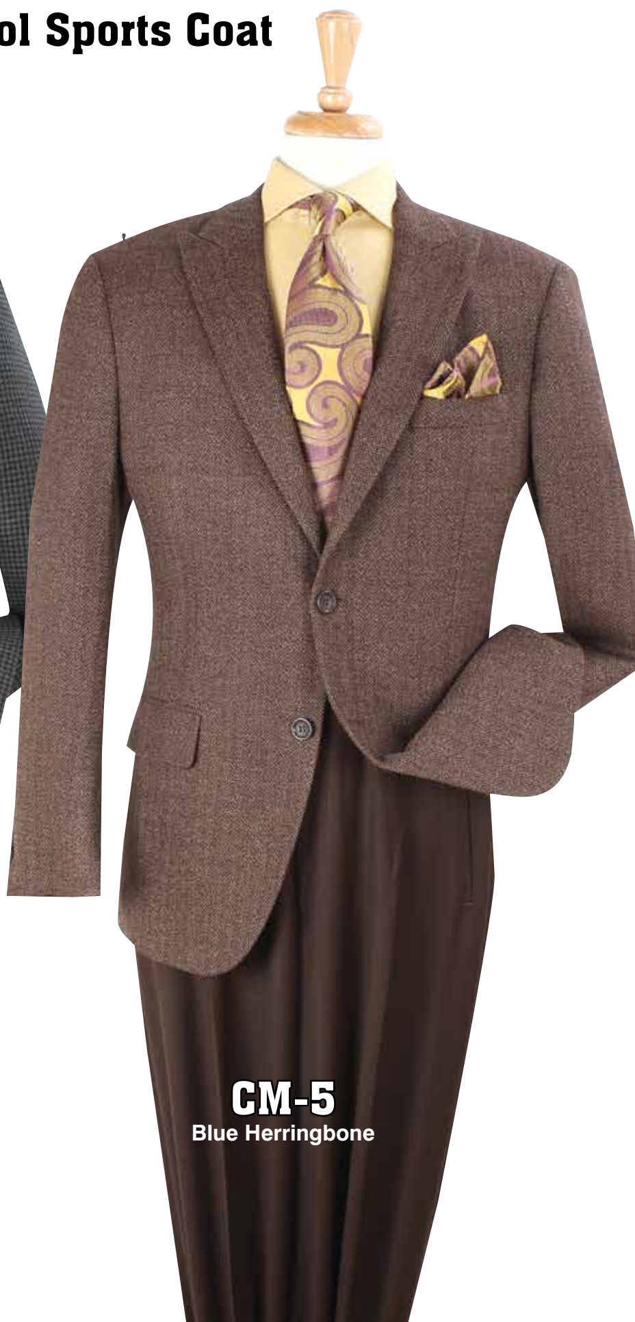
CM-5 Blue Herringbone