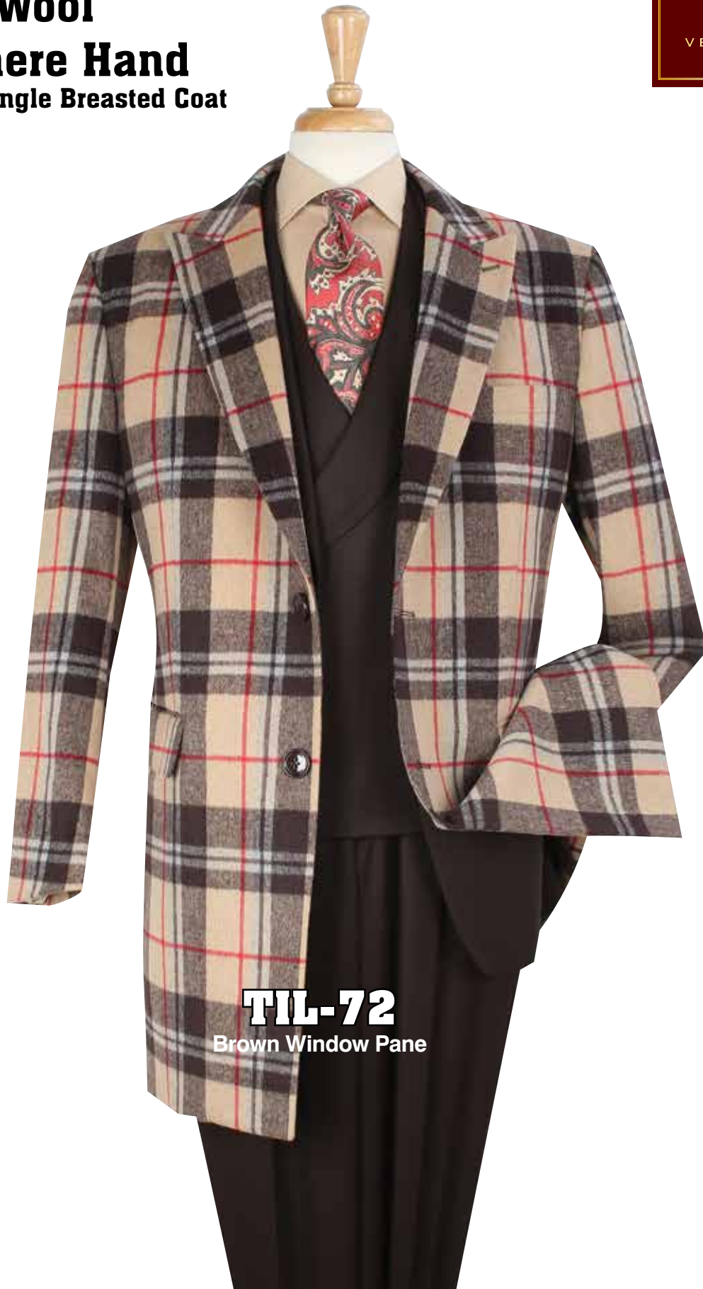
TIL-72 Brown Window Pane