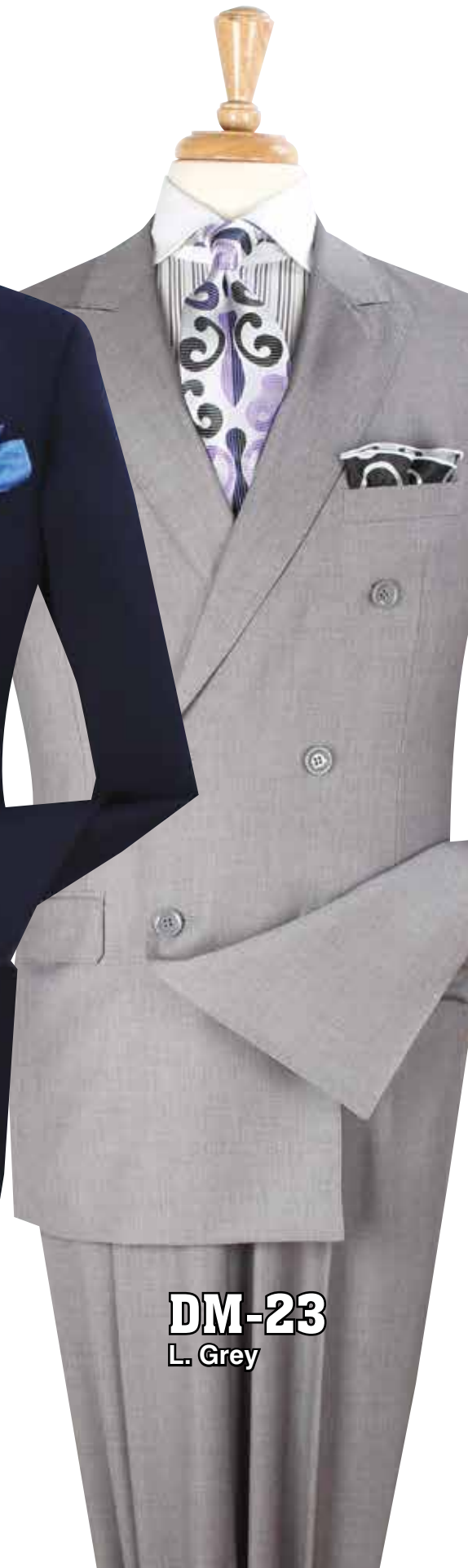
DM-23 L. Grey