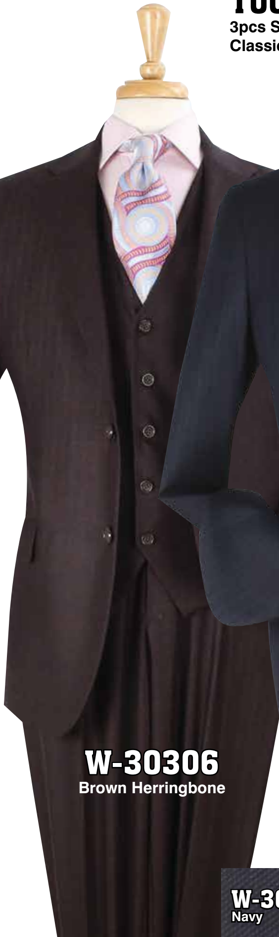
W-30306 Brown Herringbone