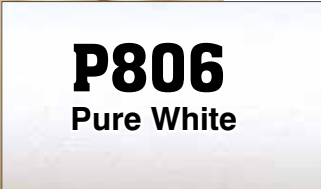
P806 Pure White

Available P802 Navy , P803 L. Grey , P804 Royal Blue Size: 38R-64R, 40L-60L