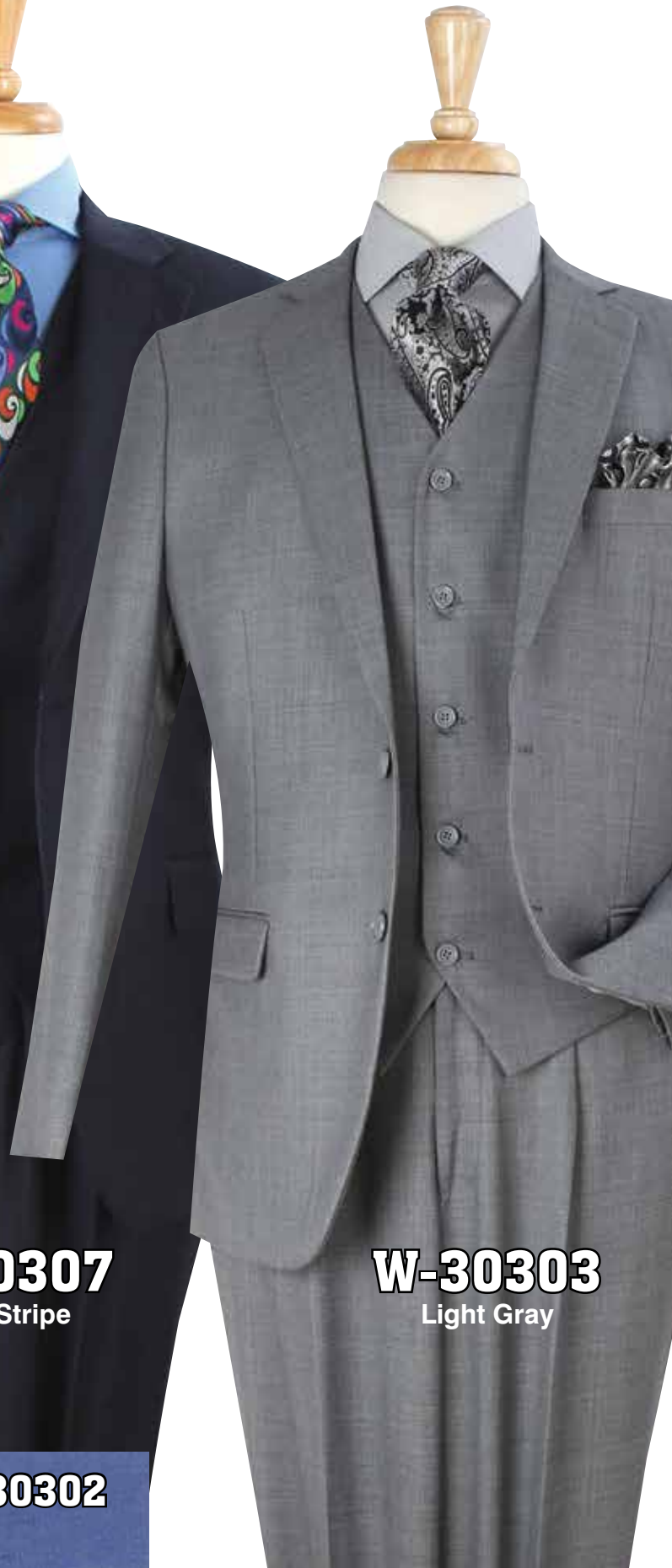
W-30303 Light Gray