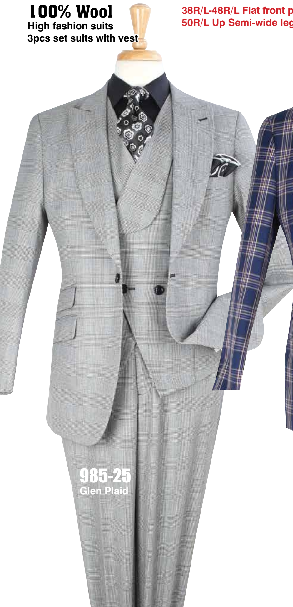
985-25 Glen Plaid