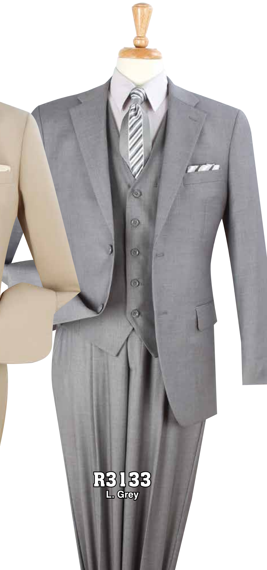
R3133 L. Grey