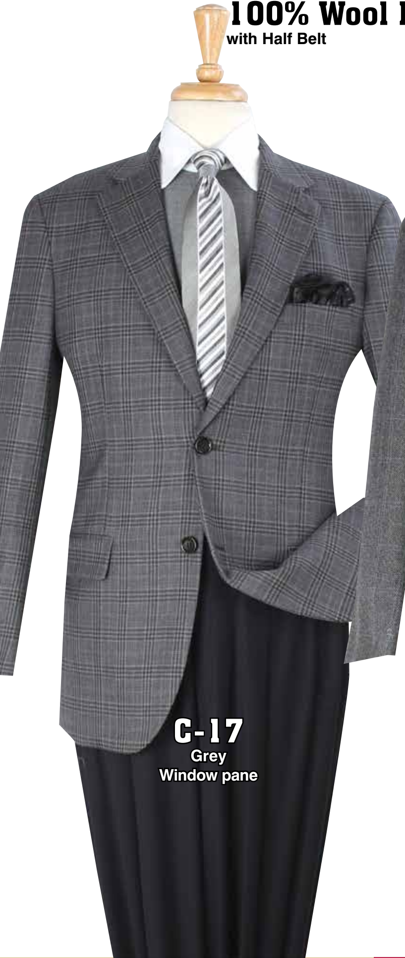
C-17 Grey Window pane