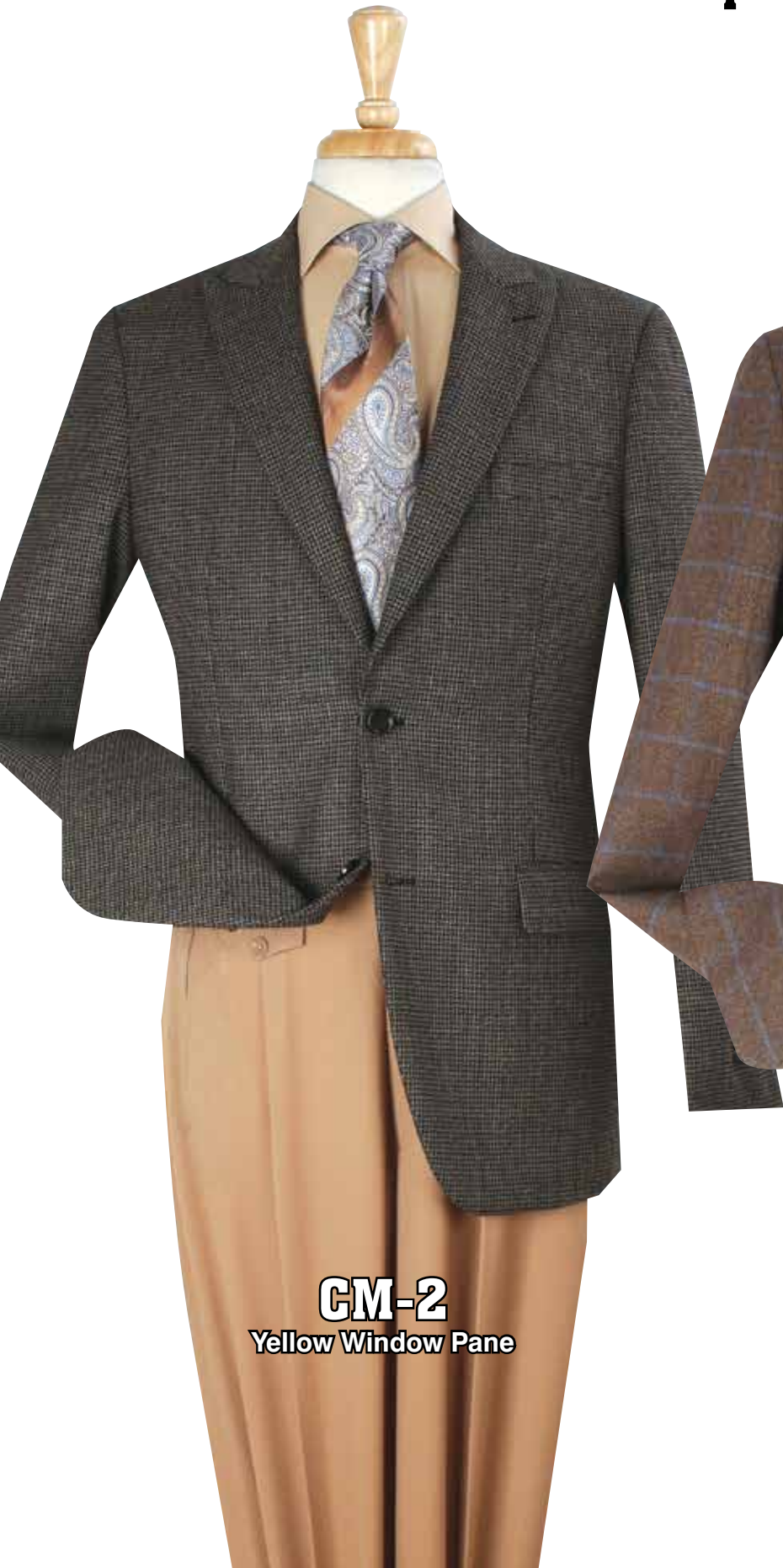
CM-2 Yellow Window Pane