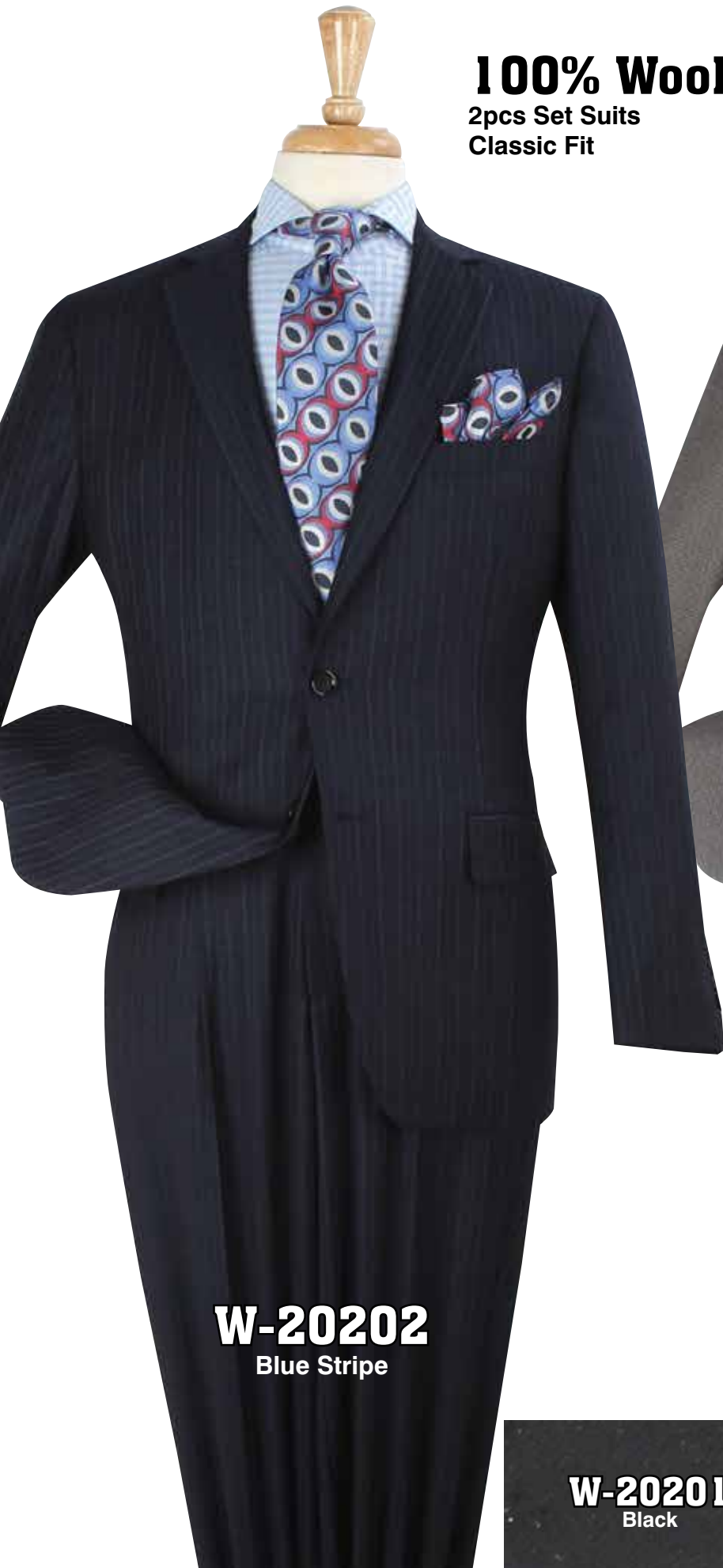
W-20202 Blue Stripe