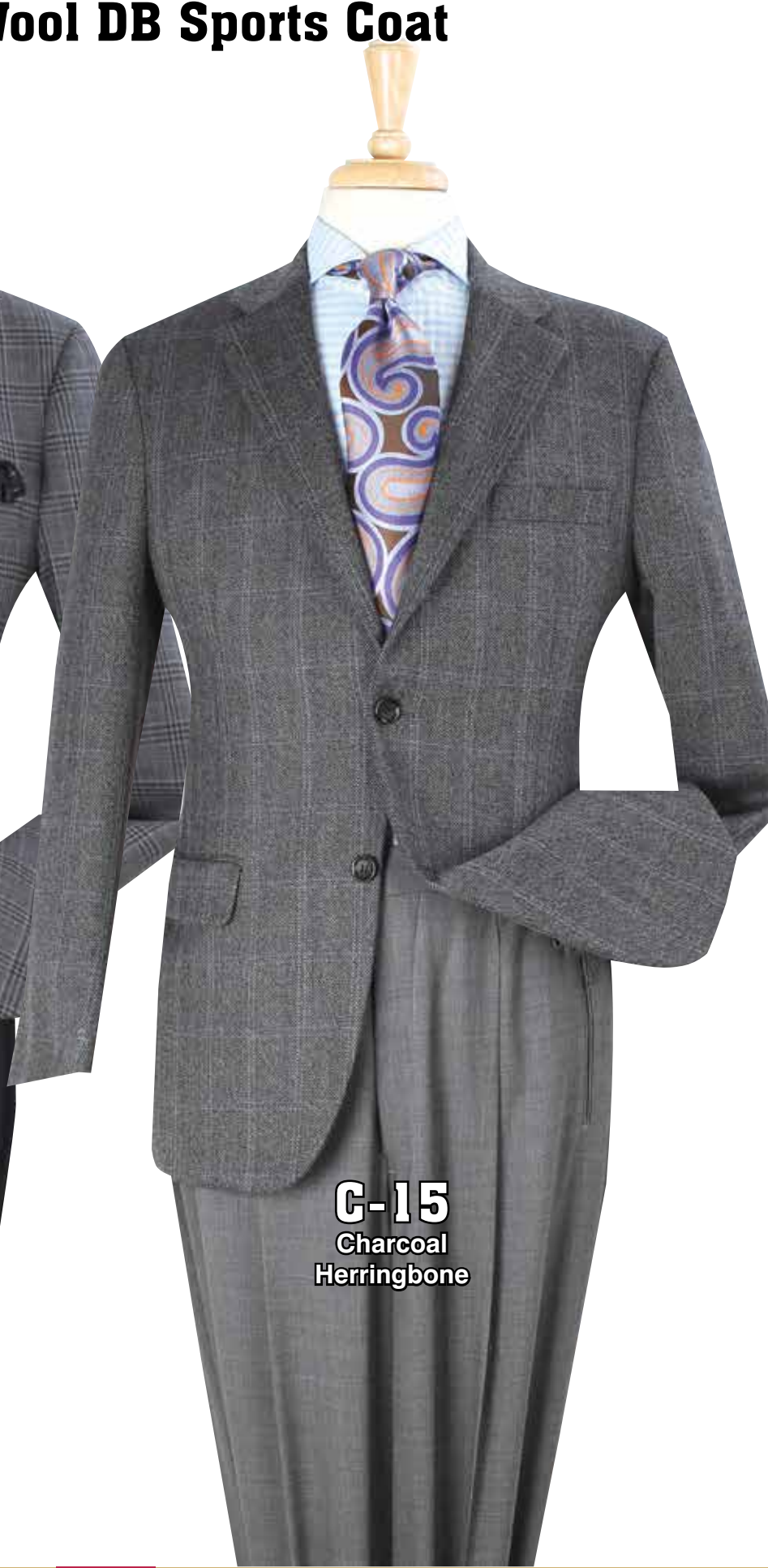
C-15 Charcoal Herringbone