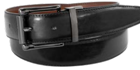
SA517-221 Black Side

Polish up with the Cosmo reversible belt. At 34mm, this belt features a distinctive gunmetal twist reversible buckle, single stitched edge and a burnished finish on the reverse cognac side. A great value!