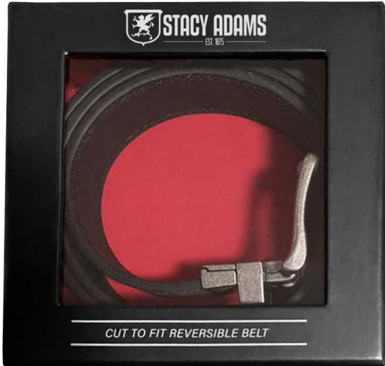
SA951-221 Black/Cognac Reversible