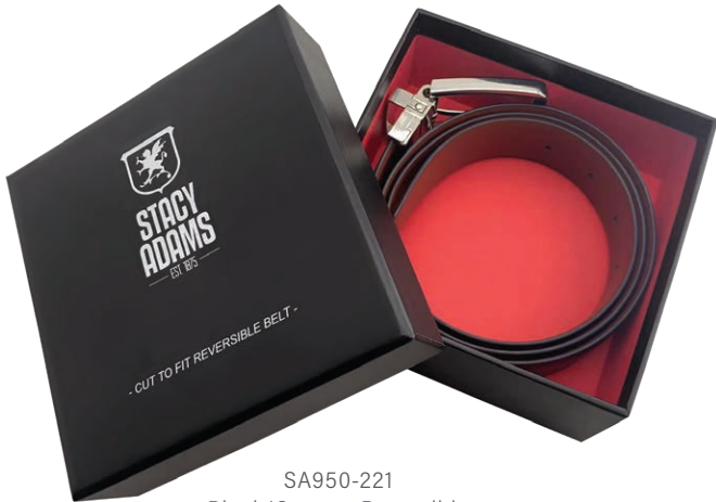
SA950-221 Black/Cognac Reversible

NEW! The Winston is a 34mm cut-to-fit reversible dress belt with a polished silver buckle with lasered Stacy Adams logo. Instructional label (attached to belt) and Stacy Adams packaging included.