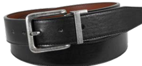
SA518-221 Black Side