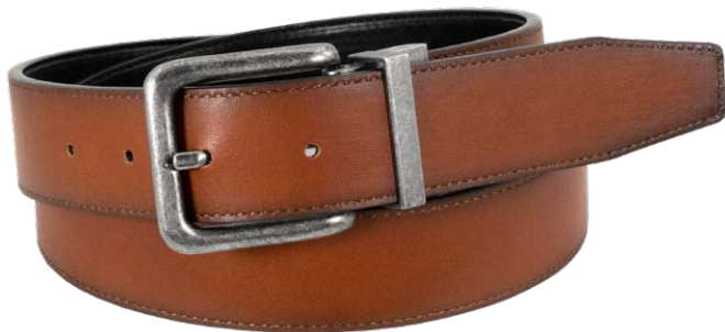
SA518-221 Cognac Side