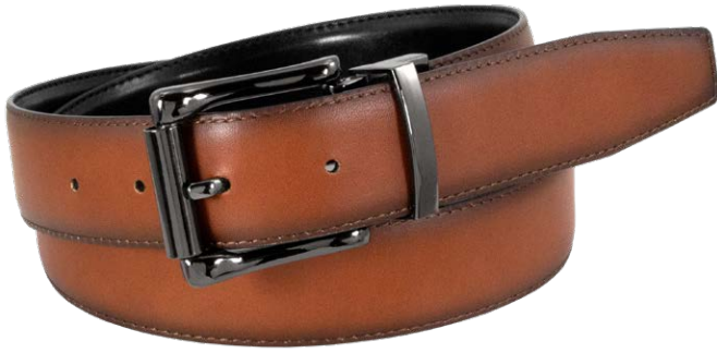
SA517-221 Cognac Side