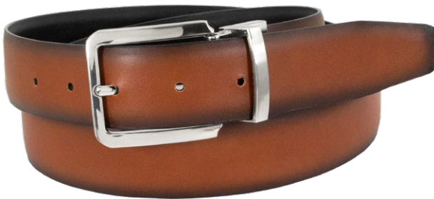
SA516-221 Cognac Side

Clean and classic, the Frasier is 34mm and features a feathered edge, silver twist reversible buckle and a burnished finish on the reverse cognac side. A great value!