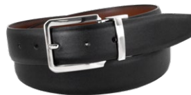
SA516-221 Black Side

Clean and classic, the Frasier is 34mm and features a feathered edge, silver twist reversible buckle and a burnished finish on the reverse cognac side. A great value!