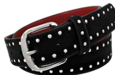
SA523-042 Black w/ Silver

Step in to style with the Stacy Adams Valentino belt. At 38mm, this belt features a studded fabric design that you can pair with matching footwear or wear it to make a statement. Exclusive red backing finishes the look.