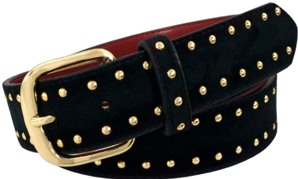
SA523-715 Black w/ Gold