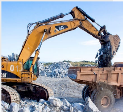
EXCAVATION AND LOADING EQUIPMENT