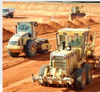
FORMING AND COMPACTING EQUIPMENT