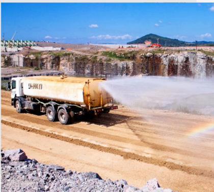
WATER HANDLING EQUIPMENT