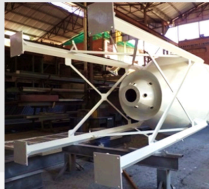
CEMENT PRODUCTION EQUIPMENT