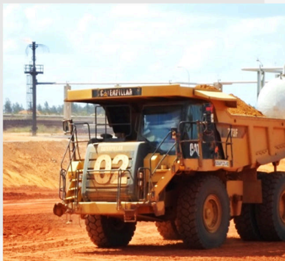
MATERIAL HANDLING EQUIPMENT