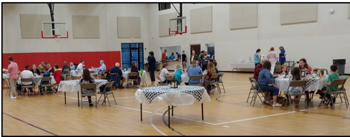
Parishioners enjoying dinner in the Family Center/Gym

The Knights and the Ladies Auxiliary will donate funds from the Fish Fry to the Youth Ministry to help pay for some of their expenses to support the Steubenville Retreat.