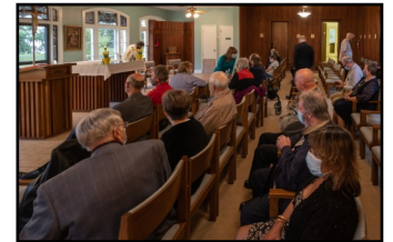
Parishioners at the Chapel in Marywood, getting ready for Mass

The next time we come together to share with family and friends for Corporate Communion, mark the date on your calendar. You will really appreciate the comradery and unity we have and what we do for our church and community.