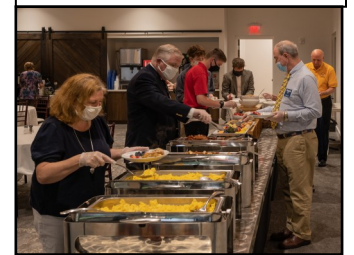
Parishioners getting their Breakfast