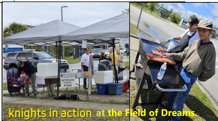
knights in action at the Field of Dreams.