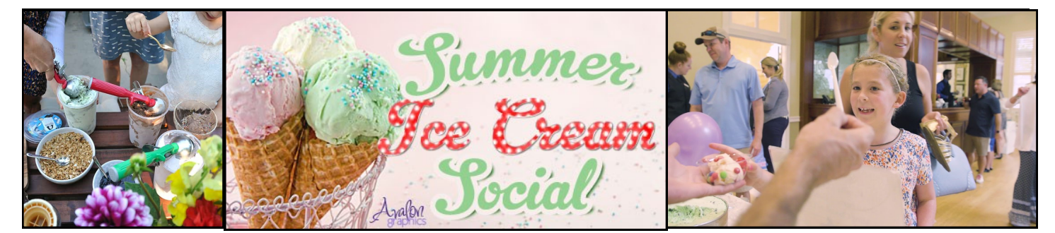
All families are invited to join us for the ICE CREAM SOCIAL on Sunday August 15, 2021 after the 11am Mass in the Family Center/Gym. This is an opportunity to enjoy a delicious ice cream and fellowship.