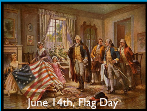
June 14th, Flag Day

When the American Revolution broke out in 1775, the colonists weren't fighting united under a single flag. Instead, most regiments participating in the war for independence against the British fought under their own flags. In June of 1775, the Second Continental Congress met in Philadelphia to create the Continental Army—a unified colonial fighting force—with the hopes of a more organized battle against its colonial oppressors. This led to the creation of what was, essentially, the first "American" flag, the Continental Colors. For some, this flag, which was comprised of 13 red and white alternating stripes and a Union Jack in the corner, was too similar to that of the British. George Washington soon realized that flying a flag that was even remotely close to the British flag was not a great confidence-builder for the revolutionary effort, so he turned his efforts towards creating a new symbol of freedom for the soon-to-be fledgling nation. Continued on page 7.