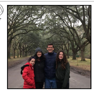
Family of the Month The Miles Family