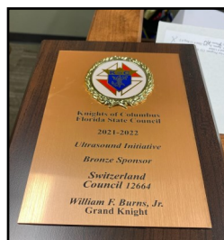
Bronze Sponsor Ultrasound Initiative Award