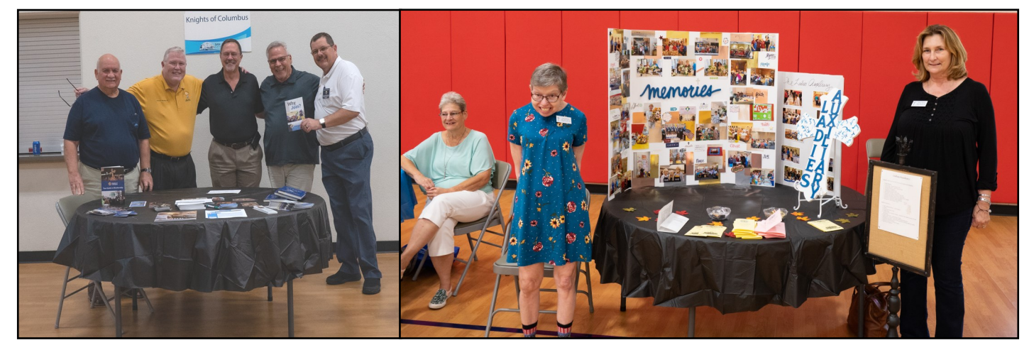
Ministry Fair on September 12th. Knights on the left and Ladies Auxiliary on the right.