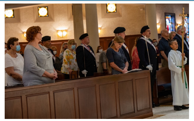
Color Guard participating at the 5:15pm 9/11 Mass