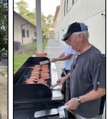
Cooking for the Youth Group on August 25th