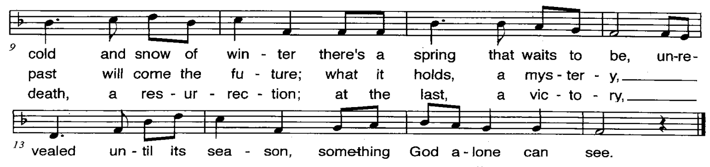
Reprinted under OneLicense.net #A-715560 United Methodist Hymnal