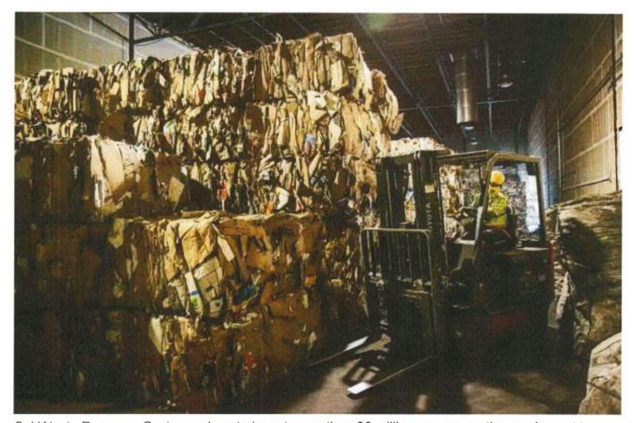
Cal-Waste Recovery Systems plans to invest more than $6 million on new sorting equipment to produce cleaner bales of recyclables.

"It's going to take domestic demand to replace what China was buying," he said. "It's not going to be a quick turnaround. It's going to be a long-term issue."