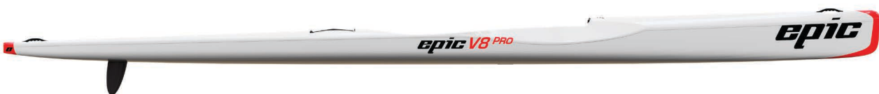
V8 Pro Length 5.79 m • Width 50.8 cm • Depth 32 cm • Weight (Elite 10.4kg - Ultra 12.5kg - Performance 15kg)