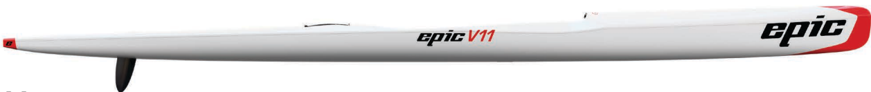
V11 Length 5.79 m • Width 43 cm • Depth 33 cm • Weight (Elite 9.4kg - Ultra 10.7kg)