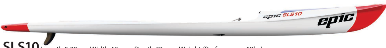
SLS10 Length 5.79 m • Width 48 cm • Depth 39 cm • Weight (Performance 18kg)