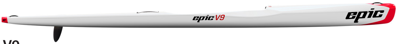
V9 Length 5.79 m • Width 49 cm • Depth 32 cm • Weight (Elite 10.4kg - Ultra 12kg - Performance 14.5kg)