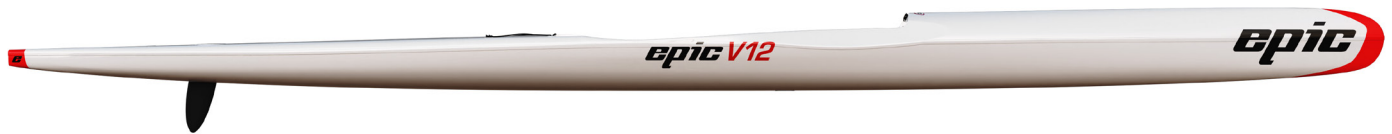
V12 Length 6.2 m • Width 43 cm • Depth 34.6 cm • Weight (Elite 10.4kg - Ultra 12kg)