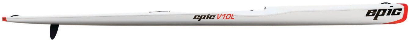
V10L Length 6.15 m • Width 44 cm • Depth 30 cm • Weight (Elite 10.4kg - Ultra 11.8kg)