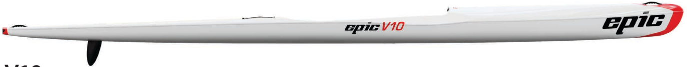
V10 Length 6.25 m • Width 45 cm • Depth 34 cm • Weight (Elite 10.4kg - Ultra 11.4kg - Performance 14.1 kg)