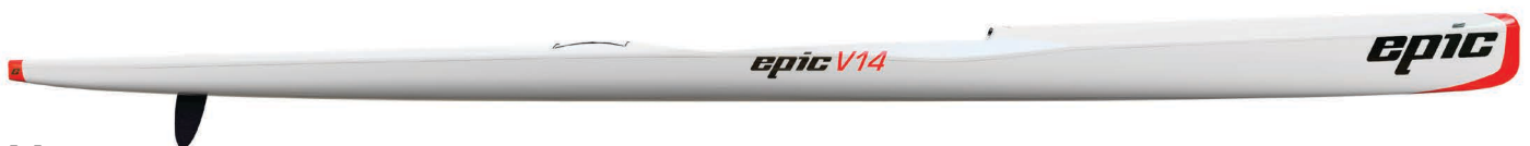
V14 Length 6.4 m • Width 42.9 cm • Depth 32 cm • Weight (Elite 10.4kg - Ultra 12kg)