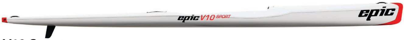
V10 Sport Length 6.1 m • Width 48 cm • Depth 33 cm • Weight (Elite 10.4kg - Ultra 12.3kg - Performance 16kg)