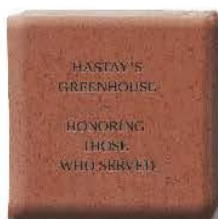
8x8 Reg. Red Sample Brick