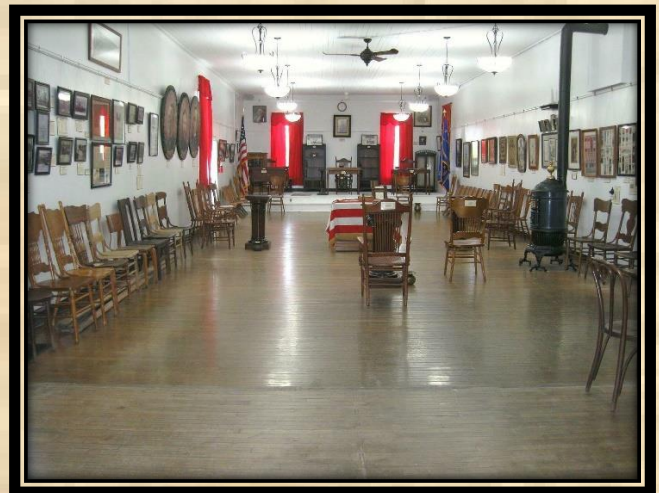
Meeting Hall in 2024