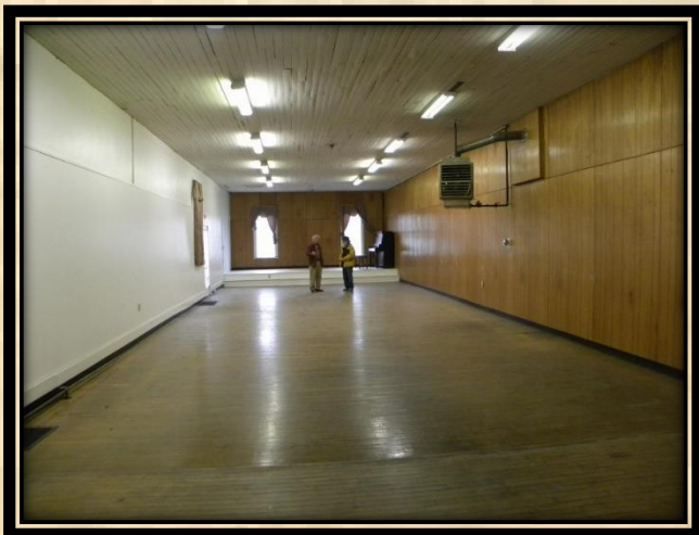
Meeting Hall in September, 2013

Join us on Saturday, September 14 th from 10:00 AM to 4:00 PM as we celebrate our 11 th anniversary. We will be joined by special exhibitors who are well-versed in the artifacts in their collections and the history of the Grand Army.