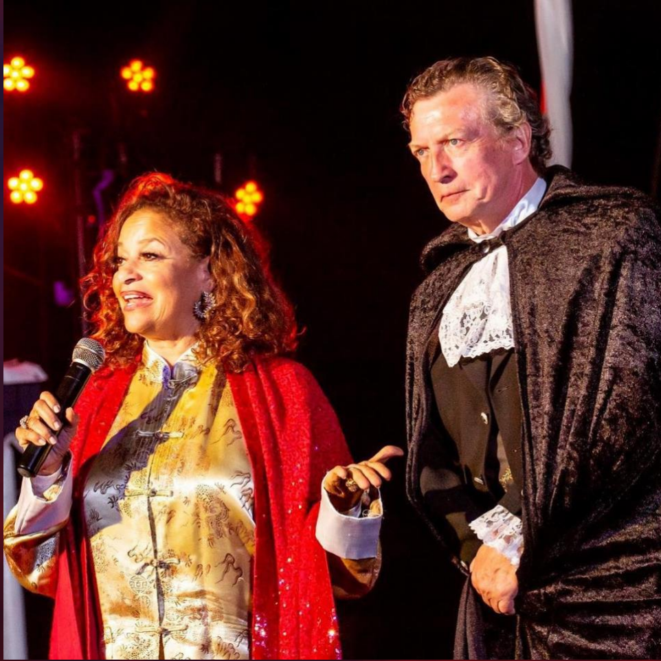
Debbie Allen and Nigel Lythgoe at Luminario Ballet's Masquerade Gala, Jonathan Beach Club, 2018