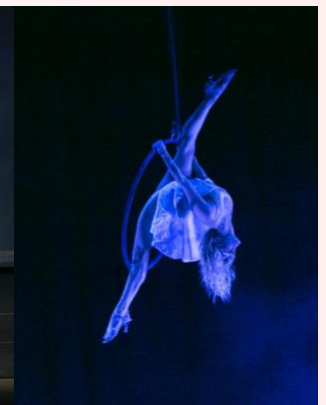
"The Last Supper"