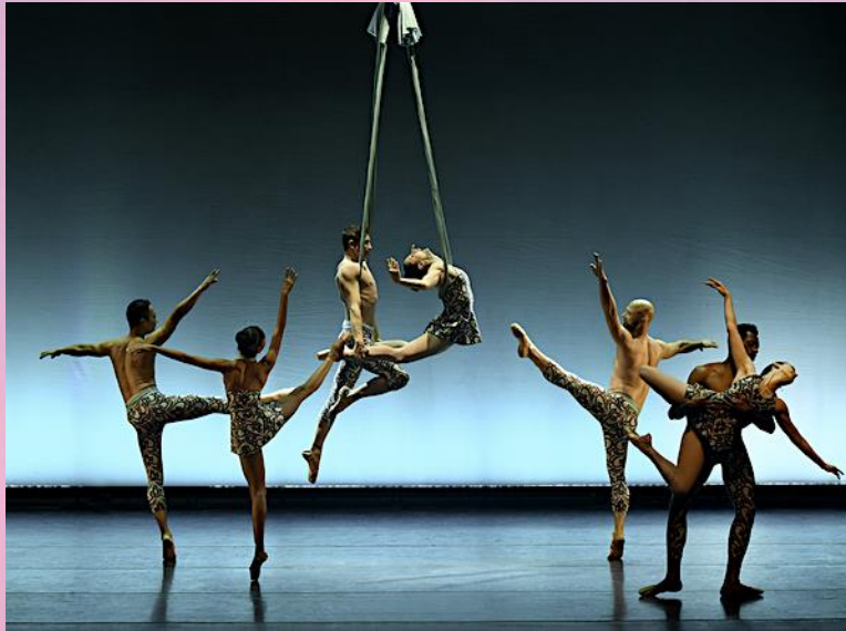
“Listen to My Heart” one minute excerpt https://youtu.be/e4WN3hZOheY