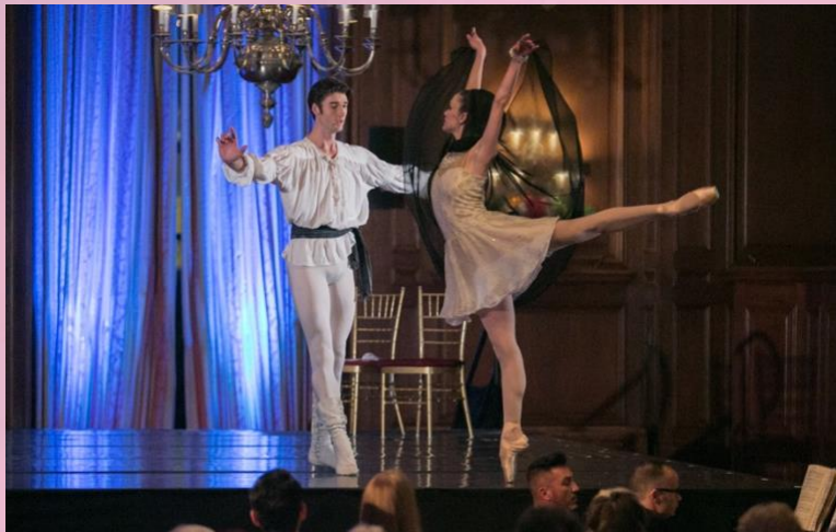
“Winterreise” two minute excerpt https://youtu.be/Y-RPbxFuNK0