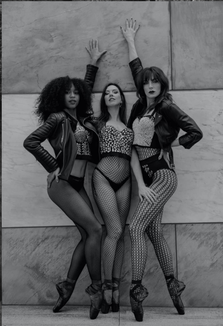
Hard as a rock

Tel: 818-235-6588 Email: staff@luminarioballet.org