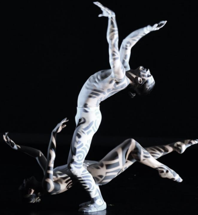
“TRAILS Ocean” media art: Paul Ackerman