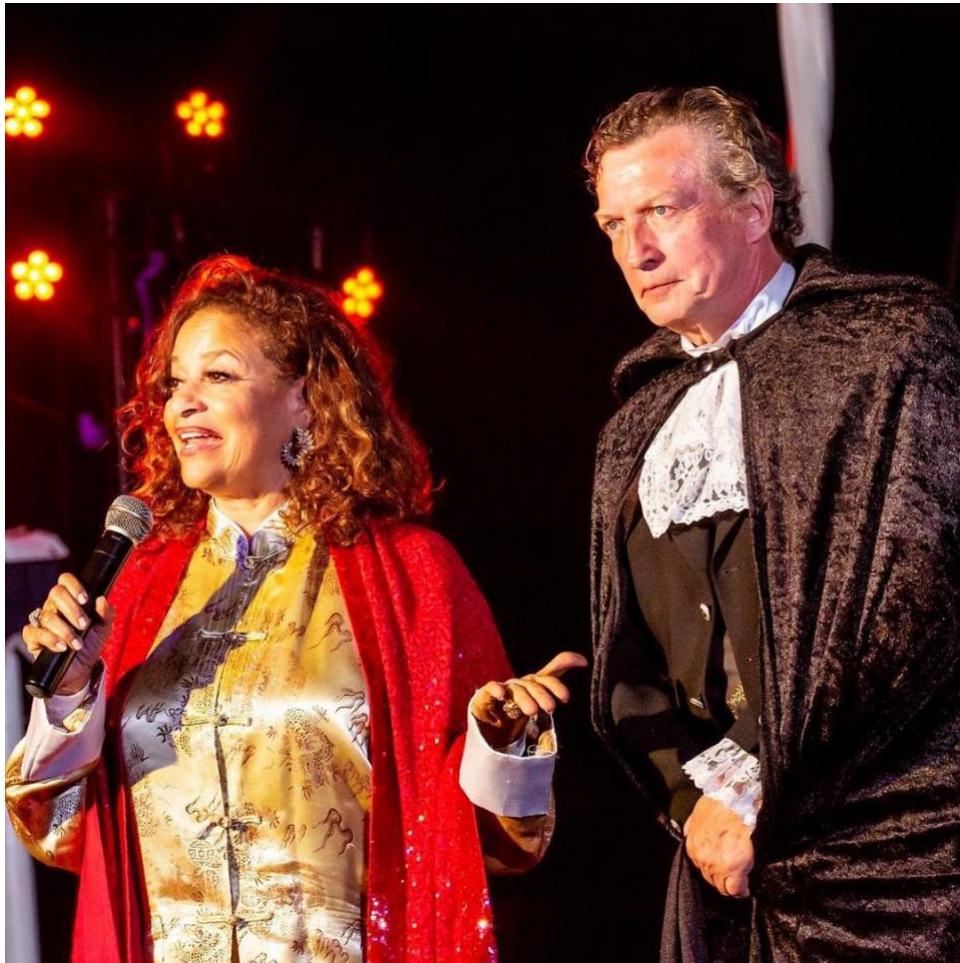
Debbie Allen and Nigel Lythgoe at Luminario Ballet's Masquerade Gala, Jonathan Beach Club, 2018