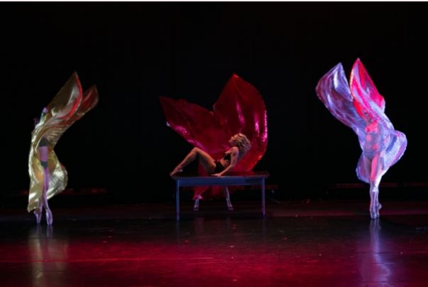
"The Last Supper"