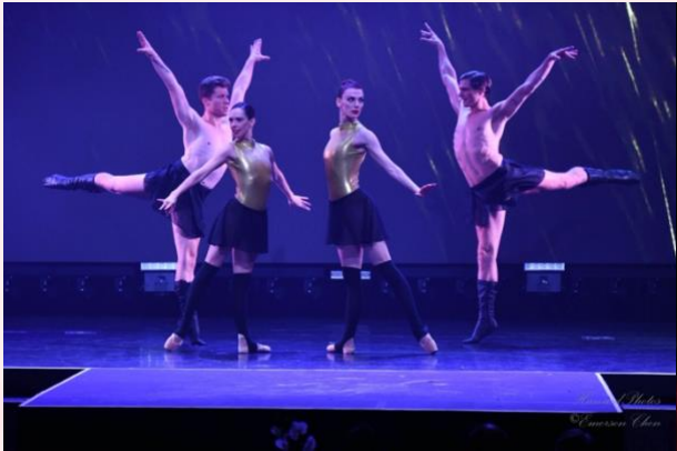
"Hard As A Rock"