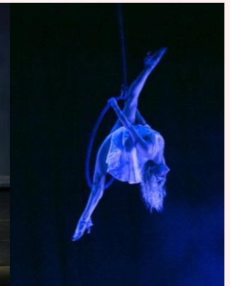
"The Last Supper"