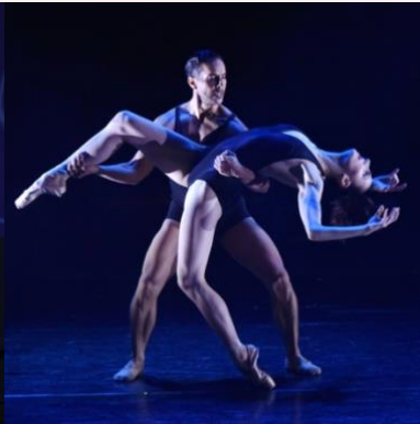
"If the Walls Could Scream"