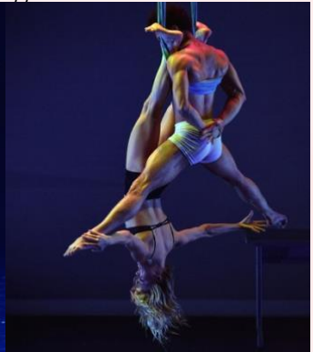
"The Last Supper"