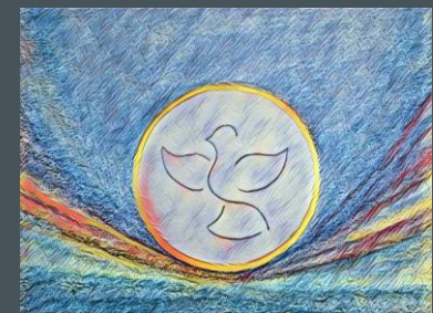
St. Michael's Independent Catholic Church