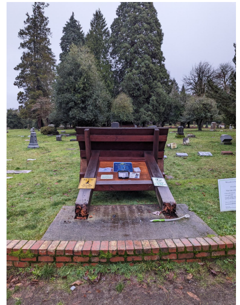
Above: The fallen bulletin board, before being tarped for protection.

We have high hopes that the project will be funded, and even higher hopes that we will still have a good shot at securing funding in 2025 to address the headstone restoration effort. Thank you for your understanding, patience and continued support while we work to maintain and enhance this space.