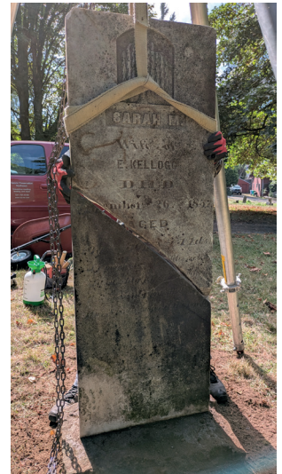
A broken Kellogg grave marker is prepared for repair.

The team started work in September and will continue until all of the twenty-five headstones and grave markers have been reset, leveled, epoxied, and re-erected. While maintenance of all headstones is important and will continue to be a priority for the Board, the attention to these most egregious will go a long way in reaffirming our commitment to the preservation of this special property. Thank you for your continued interest and support!