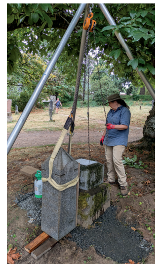
Historic Preservation NW working on-site with a manual lift to re-erect a toppled Frey grave marker.

Greenwood Hills Cemetery Maintenance Association is a volunteer organization dedicated to maintaining the grounds of Greenwood Hills Cemetery in a manner that respects the dead, honors the living, and preserves a valuable connection with our rich pioneer history. Through responsible stewardship of resources, we strive to maintain a safe and beautiful open space where people can come to remember the past and enjoy the natural world which we hold in sacred trust for the future.