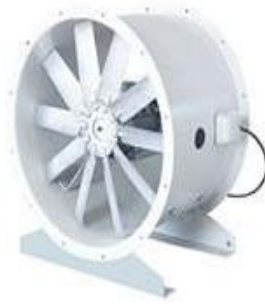
TUBE AXIAL FLOW FANS