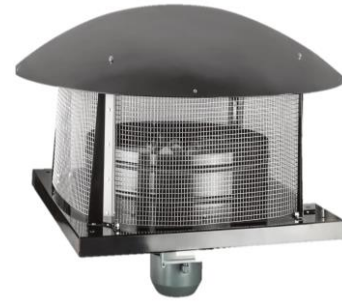
Roof type Axial fan.