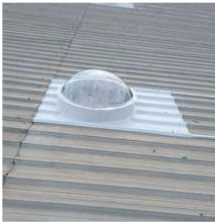
TUBULAR SKYLIGH supply and installation.