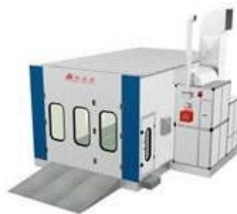
PAINTING BOOTH EXHAUST SYSTEMS