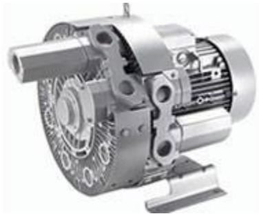
HIGH PRESSURE BLOWERS