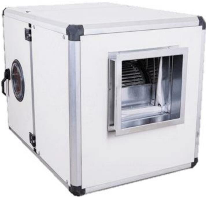
CABINET TYPE FAN