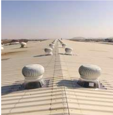
ROOF VENTILATORS supply and installation.