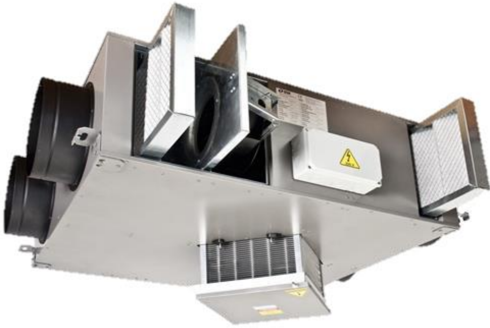
HEAT RECOVERY UNIT.