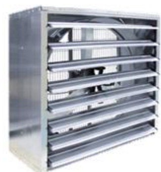
Wall mounted exhaust fan.