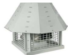
Horizontal Discharge Centrifugal Fan with Motor Out of Air