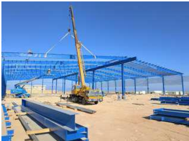
STEEL structure works and sheet replacement.