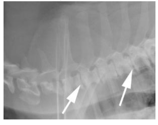
Figure 1: The white arrows point to mildly irregular endplates at T1-2 and T4-5.

Diagnosis can often be made, or highly suggested, on plain radiographs (Figures 1 and 2). The earliest radio-graphic sign of discospondylitis is narrowing or collapse of the affected intervertebral disc space. Additional signs include bone lysis of the end-plates, varying degrees of spondylosis and bone reaction, and sclerosis of the end-plates and body.