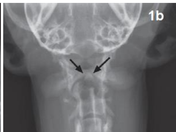
Figure 1a and 1b: Lateral (Figure 1a) and ventrodorsal (Figure 1b) projections of the atlanto-axial junction of a patient with a hypoplastic dens. Note the increased space between the dorsal arch of C1 and the cranial spinous process of C2 (double white arrow). The hypoplastic dens is well visualized in the VD view (black arrows), but on the traditional lateral projection (Figure 1a), the area of the dens cannot be clearly seen because of superimposition of the wings of the atlas

Although slightly flex-ing the cervical neck (Figure 2a) can exaggerate the increased space often seen between the atlas and the axis in order to aid diagnosis, this is dangerous in a patient with AA instability as it can exert more pres-sure on the spinal cord at this level. An open mouth view has also been described in order to highlight the dens, but this technique, too, can further damage the spinal cord because of the increased flexion of the spine required. A safer alternative for obtaining a radiographic diagnosis when neutral lateral views fail to do so is obtaining an oblique lateral view with the cervical spine in a neutral position (Figure 2b). This view highlights the area of the dens by removing the superimposition of the lateral spinous processes/ wings of the atlas while protecting the cord from potential trauma.