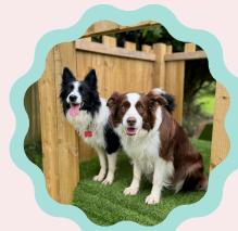
Bounty & Raffles

We would like to say a huge thank you for all your support and for trusting us to care for your fur babies. We are extremely grateful and it makes us feel proud to know we're doing a good job. A highlight to our month is being called 'DOGGY CENTRE PARCS'. We've also been doing some baking making our own dog treats.