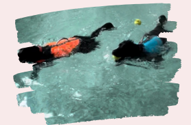
Milo and Buddy having a holiday swim