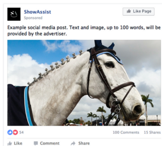
Image with 100-word maximum post provided by advertiser