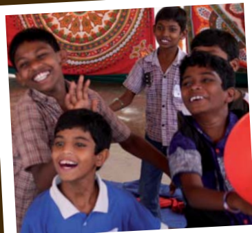
PLAY, THANKS TO YOUR SUPPORT!