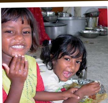
AGAPE'S ORPHANS HAVE PLACES TO EAT,