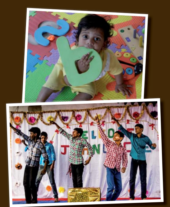
Agape is helping 240 children orphaned by AIDS ~ thanks to YOU!

Please visit agapeintl.org or call 978-443-3180 today!