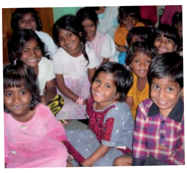
REMEMBERING AGAPE'S EARLY DAYS & SWEET FACES!

Thank you for helping Agape - and each child - reach and achieve our hopes and dreams!