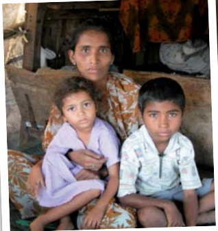
THIS POOR, HIV POSITIVE MOTHER ENTRUSTED SAI TO AGAPE'S CARE IN 2004

YOUR INVESTMENT MULTIPLIES AS STUDENTS GROW, GIVE BACK AND IMPACT OTHERSI