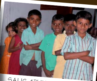
SAI IS 4<sup>TH</sup> IN THIS LINE OF AGAPE 'SIBLINGS'