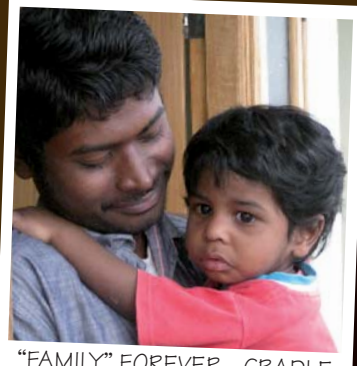
"FAMILY" FOREVER - CRADLE TO COLLEGE & BEYOND!