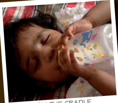
FROM THE CRADLE ...

A large lot would allow us to own a school building with plenty of classrooms; computer, science and audio visual labs; a library; and quiet places for our college students to study. The many donated supplies we use at our rented school can be used to customise each room for maximum benefit for our students. ~ Continued ~