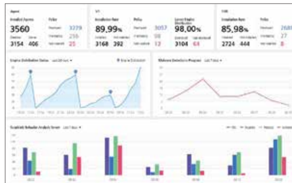
Web-based Management Console of AhnLab EPP