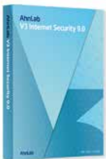
V3 Internet Security 9.0