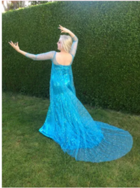
The Snow Queen