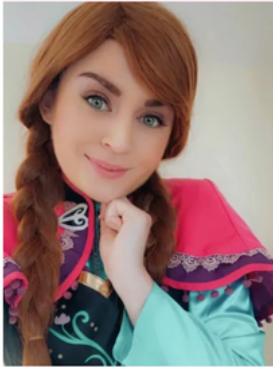
The Snow Princess