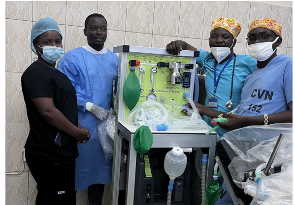
New Glostavent anaesthesia machines at the Van Norman Clinic have been used for over 225 Caesarean-sections per month in 2024, saving the lives of mothers and babies.

We are grateful to the anaesthesia professionals who voluntarily shared their skills to provide training in low-income countries and covered their own expenses. None of this would have been possible without their generosity.