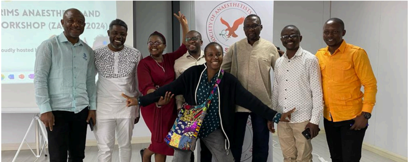
The teaching faculty at the GASOC virtual reality anaesthesia workshop held with the University of Zambia.

Safe Anaesthesia Worldwide's mission is to ensure safe, affordable anaesthesia is available to every patient in need.