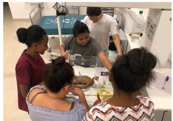
Midwives at The Good News Hospital in Mandritsara receive training on the new Baby CPAP equipment that keeps sick and premature babies breathing.