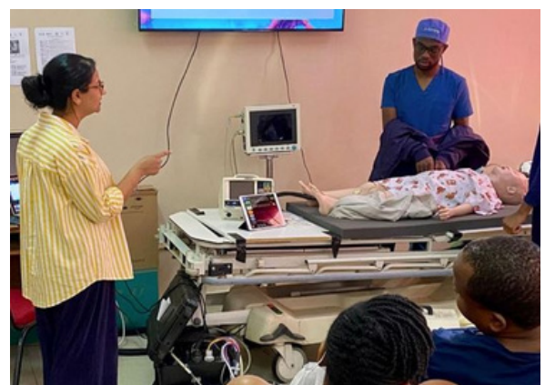
Simulation training sessions allows replicating critical or rare events in a safe space, allowing trainees to learn without fear of patient harm.