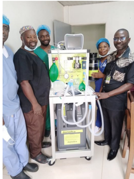
Delighted staff receive a new Glostavent anaesthesia machine at Nkwen Baptist Hospital, Cameroon, to help treat increasing numbers of patients.

These equipment donations were made possible by the generosity of our supporters. Thank you.