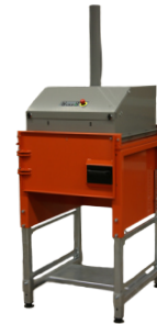
The single-chamber unit with swing door

The compactor can be supplemented with additional chambers for rapid compaction. The front door on the single-chamber unit is replaced by an apron for easy transition of the press head from one chamber to the next.