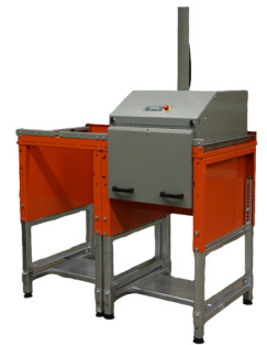
The multiple-chamber unit equipped with an apron with two handles