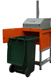
Designed for standard 96 gallon toter.

The 4096 is perfect for the food service sector where organics need to be transported in toters. This unit provides impressive volume reduction, with an average compaction ratio of 3:1.