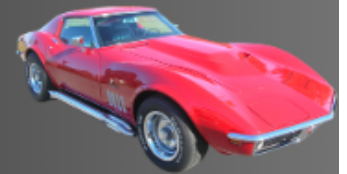
1969 Chevrolet Corvette