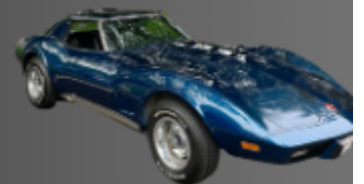
1976 Chevy Corvette Stingray