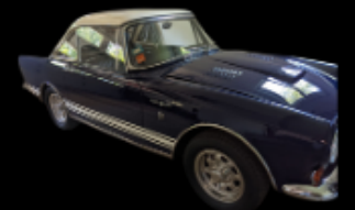
1967 Sunbeam Tiger MKII