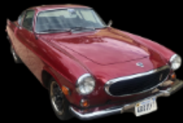
1970 Volvo 1800E