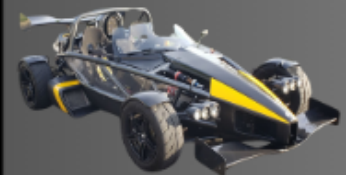
2016 Ariel ATOM 3S