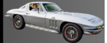
1965 Chevrolet Sting Ray