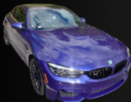
2020 BMW M4 Heritage Edition