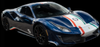
2020 Ferrari 488 Pista Piloti