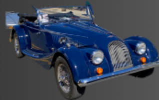
1968 Morgan +8 Coupe