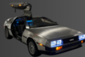
1981 DeLorean DMC-12