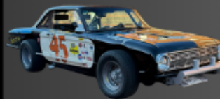
1963 Ford Falcon Modified Stock Car