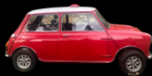
1968 Austin Mini Cooper S