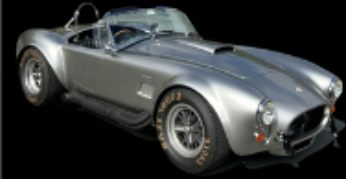
2006 ERA 427S/C