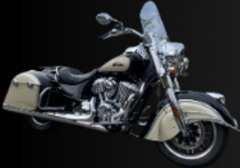
2022 Indian Springfield