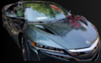
2017 Acura NSX