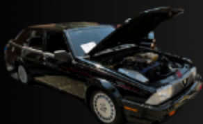
1987 Alfa Romeo Milano Verde