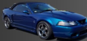
2004 Ford Mustang Cobra