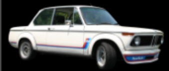
1974 BMW 2002 Turbo