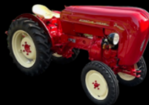
1959 Porsche 108S, Vineyard Tractor