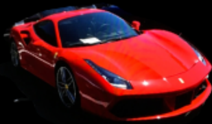
Ferrari 488 GTB