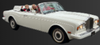
1989 Rolls-Royce Corniche III