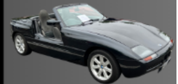
1990 BMW Z1