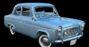
1959 Ford Anglia