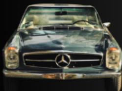
1969 Mercedes-Benz 280SL