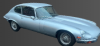
1973 Jaguar E Type Series 3 2+2