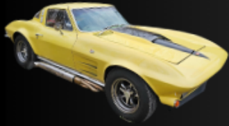
1964 Chevrolet Modified Stingray Coupe