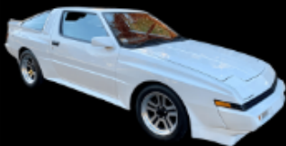
1987 Mitsubishi Starion ESI-R