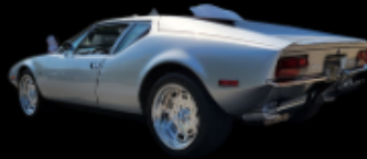
1972 De Tomaso Pantera