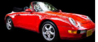
1995 Porsche 911 Carrera 2 Cabriolet