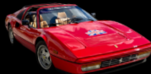
1989 Ferrari 328 GTSi