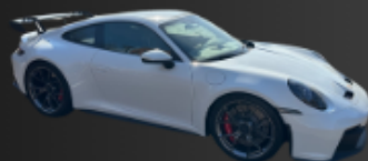
2023 Porsche GT3