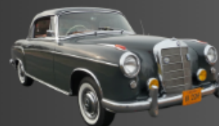
1959 Mercedes-Benz 220S coupe