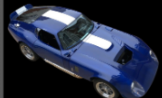
1965 Factory Five Type 65 Coupe