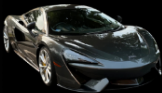
2017 McLaren 570s