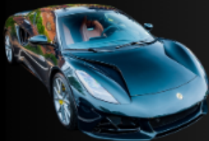
2024 Lotus Emira First Edition