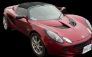
2005 Lotus Elise