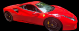
2018 Ferrari 488 GTB