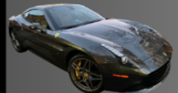
2016 Ferrari California T