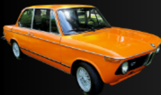
1976 BMW 2002