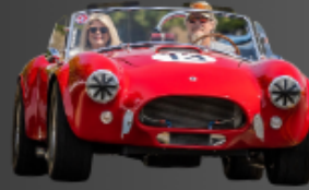
1964 Shelby FIA Cobra