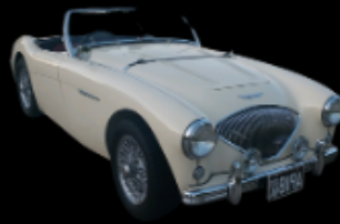
1956 Austin Healey 100 BN2