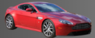
2013 Aston Martin V8 Vantage S