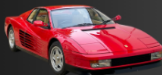
1988 Ferrari Testarossa (Eurospect)