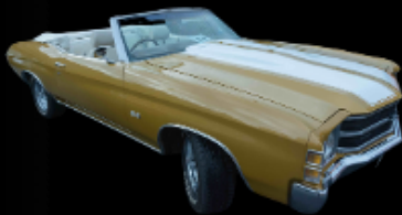
1971 Chevrolet Chevelle Convertible