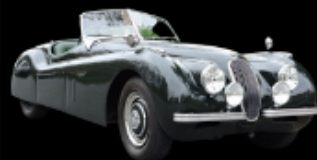
1952 Jaguar XK120 OTS