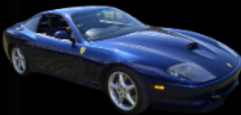
2000 Ferrari 550 Maranello