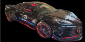
2020 Chevrolet Corvette