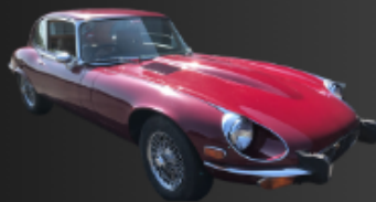
1973 Jaguar E-Type V12, 2x2