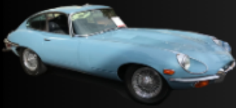
1987 Alfa Romeo Milano Verde