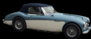
1964 Austin Healey 3000 MK III