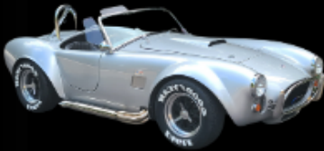
1965 Ford Shelby Cobra Replica