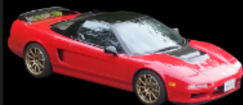
1991 Acura NSX Type R Replica