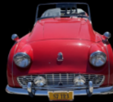
1957 Triumph TR3