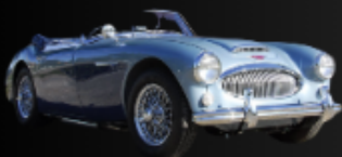
1965 Austin Healey 3000