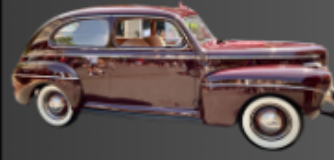
1941 Ford Super Deluxe