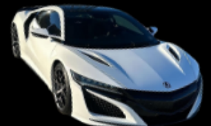
2017 Acura NSX