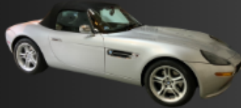
BMW 2002 Z8