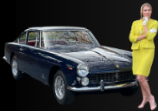
1962 Ferrari 250 GTE