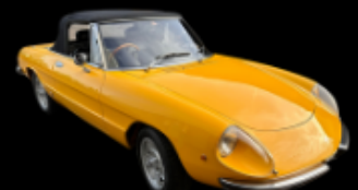
1971 Alfa Romeo 1750 Spider Veloce