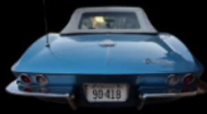
1965 Chevrolet Corvette Convertible