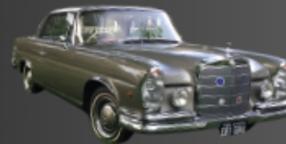
1966 Mercedes-Benz 250SE Coupe