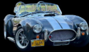
1965 Replica Cobra Factory Five MkIV