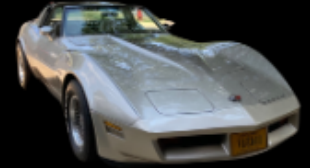
1982 Chevrolet Corvette