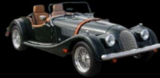
2001 Morgan Plus 8