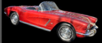
1962 Chevrolet Corvette