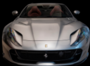
2022 Ferrari 812 GTS