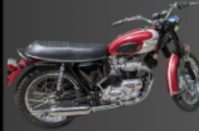
1970 Triumph Bonneville