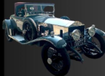
1919 Rolls-Royce 40/50 Speed-Alpine Eagle