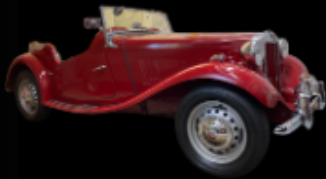
1951 MG TD