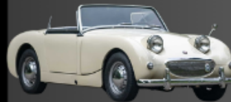
1959 Austin Healey Sprite Mark 1