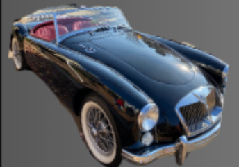
1962 MG MGA Mrk1600