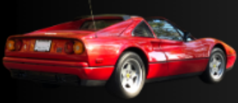
1987 Ferrari 328 GTS