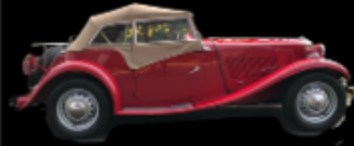
1950 MG TD