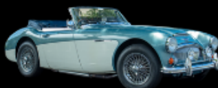
1966 Austin Healey 3000 BJ8