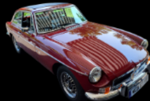
1974 MG MGB GT V8