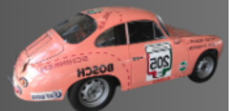
1965 Porsche 356C