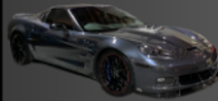
2011 Chevrolet Corvette ZR-1