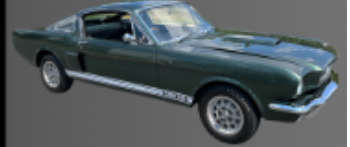
1966 Shelby GT350