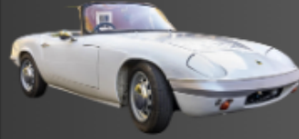
1966 Lotus Elan S2