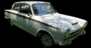
1966 Lotus Cortina