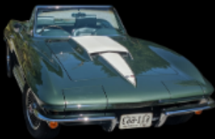
1967 Chevrolet Corvette