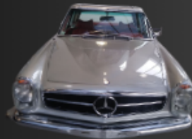
1969 Mercedes-Benz 280SL