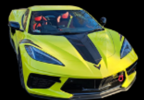
2023 Chevrolet Stingray