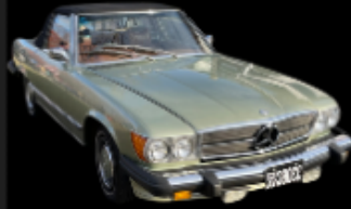
Mercedes-Benz 450 SL