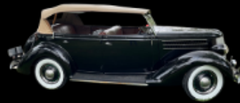
1936 Ford Phaeton