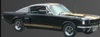
1966 Ford GT350H