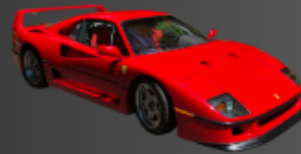
1992 Ferrari F40