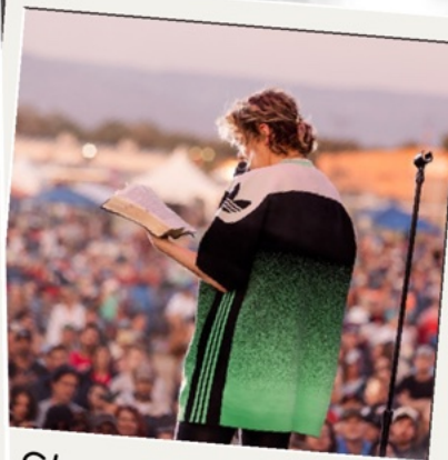
Sharing God's Word