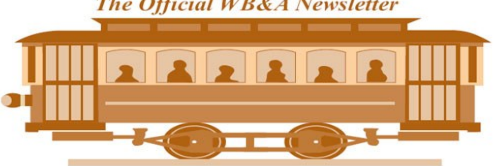
WB&A Chapter - Eastern Division - Train Collectors Association Established 1964