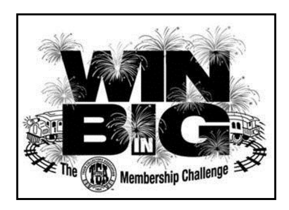
Join in the challenge; simply signing a TCA Application can make us all winners!