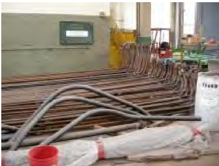
Super heater and transverse arch pipes from the 611.