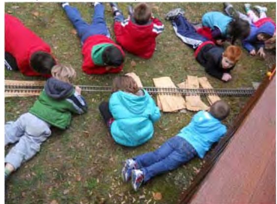
Kids waiting for the G Gauge special to clear the tunnel: Fairfax Station Tran Show, Christmas 2013.