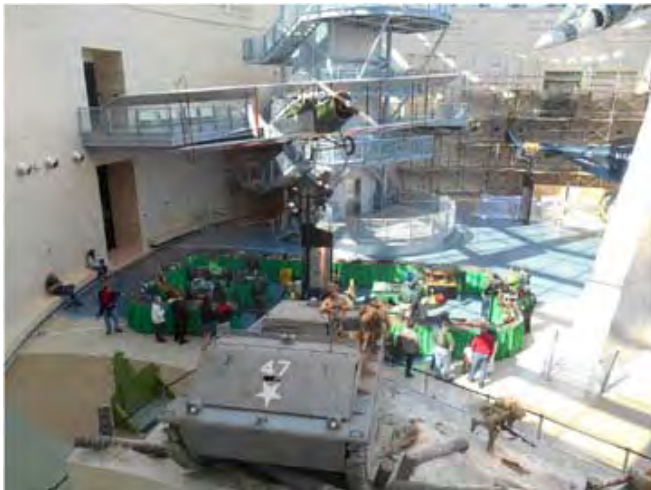
NCT playing trains under the cover of the USMC 2015

I was interviewed by Senator Bill Bradley for his Sirius radio show "American Voices." In the 15 minute session in March, we talked about the train hobby and how it has grown and changed over the years. Also how kids love trains and how helpful trains are in family and group communications. The sights and sounds in the little toys performing on their rails, seems to bring the best out of folks and joy and fun prospers.