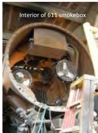
Interior of 611 smokebox