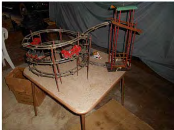
Bauer Spiral Railway waiting for kids to come play