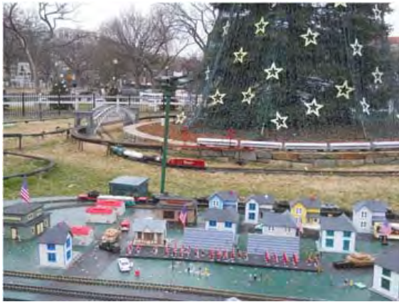
NCTRR trains around the National Christmas Tree 2013

In Mid November 2014 we set a multi-gauge, multi-club layouts in the Rockville senior center. This event benefits the Senior Center and the Rockville Lions Club. We assemble and operate layouts in G, Standard, O, HO, N, TT gauges. Another TCA member and I run the Loco doctor station repairing anything that comes in. We had about 700 in attendance enjoying the trains and all the pizzazz that goes with them.