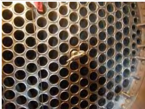
Front flue sheet