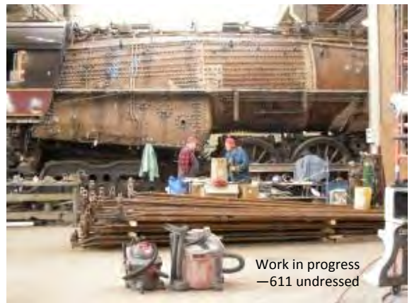
Work in progress --611 undressed

The next phase of our tour was to view some of the actual work in process. Fortunately, both Cheri George, volunteer fireman for the 611