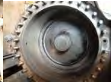
Inside view of right cylinder head