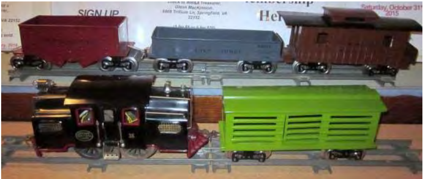
WB&A 2015 Drawing Number 2 Item: Standard Gauge Set – NO BOXES #38 Locomotive, #112 Gondola, #113 Cattle Car, #116 Ballast Car and #117 Caboose. All Lionel with TCA Stickers for the Restoration Work