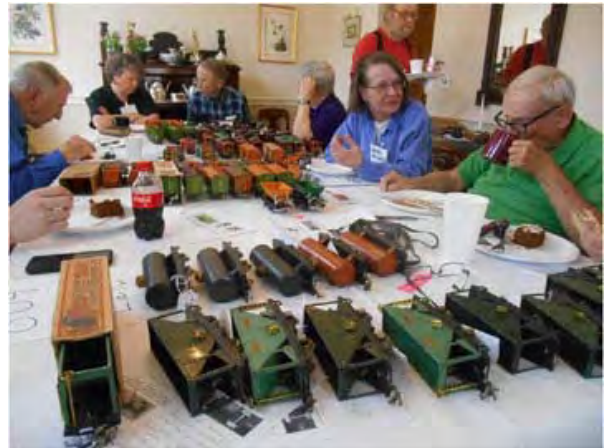
Greenberg study group in action, May 2015