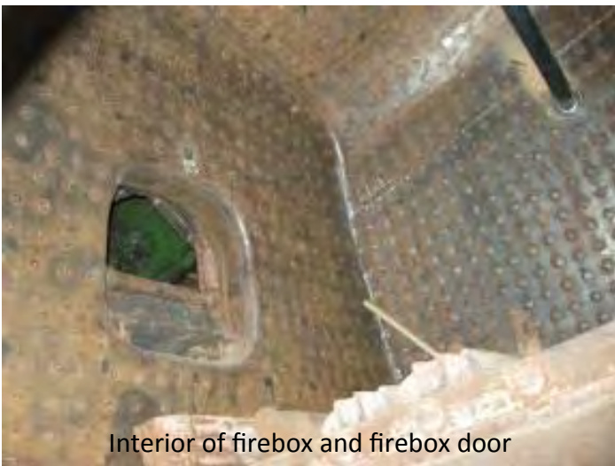
Interior of firebox and firebox door

The back shop, which has recently been opened to the public, currently houses a number of non-railroad transportation artifacts such as automobiles, trucks, fire engines and even aircraft. As our guided tour ended, we thanked Mr. Stump for his hospitality after assuring him that we would return to the NCTM in the future when we would have ample time to observe and study all of its artifacts in greater detail. We then returned to our motel after picking up some goodies at NCTM's excellent gift shop.