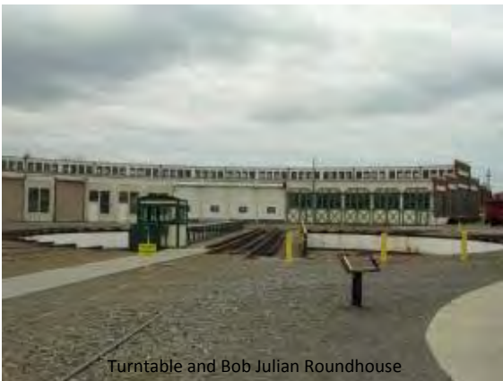
Turntable and Bob Julian Roundhouse