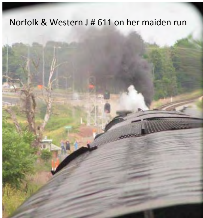
Norfolk & Western J # 611 on her maiden run