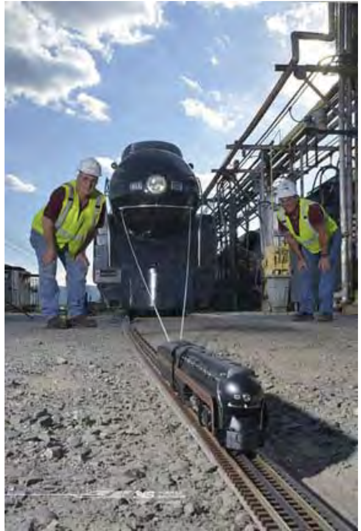
Norfolk Southern workers welcome the return of the only remaining 4-8-4 "J" class locomotive!