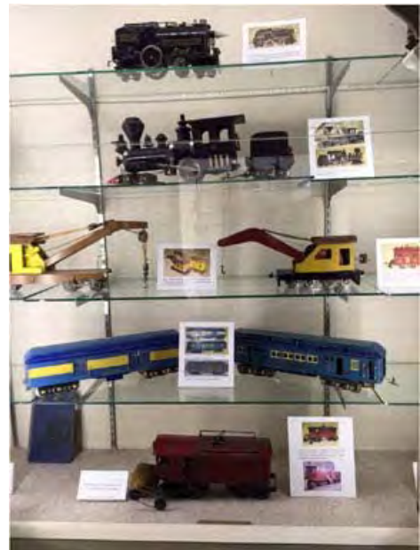
Some of my homey-dids on display at the NTTM 2015.

Recently, we have had two study group meetings working on early prewar Lionel O gauge locos and rolling stock. We have about 30 folk in the group, with about 15-20 attending each time. This will result in a series of 4 volumes on prewar Lionel O gauge trains and accessories. With this effort, I will have contributed to 17 train books in the Greenberg series.