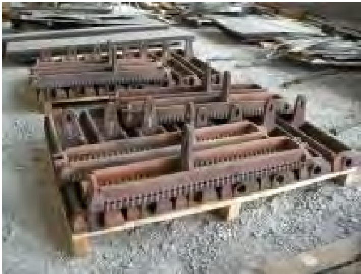
611 grates stored in the back shop.