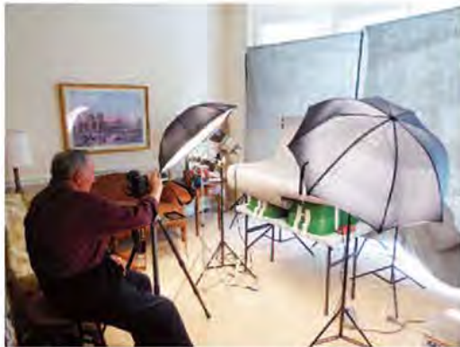
Dan Feighery (above) specialized in hard to photograph details. Alex Weihmann, not shown, photographed many cars.