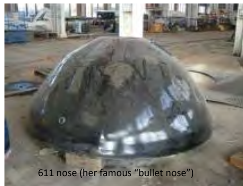
611 nose (her famous "bullet nose")

Photos by Eileen Rollyson (TCA 80-14962)