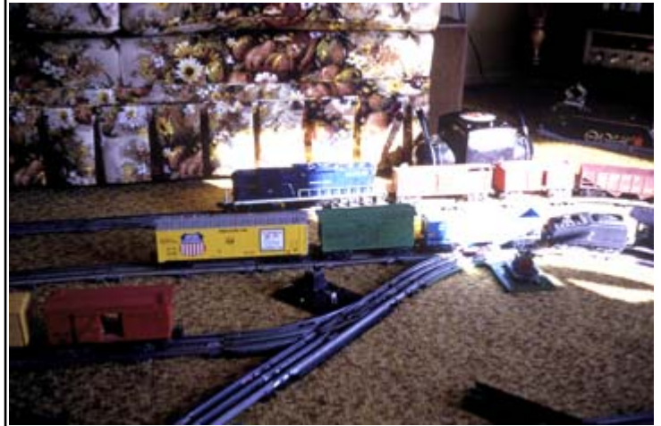
Buffalo Creek Railroad Carpet Central —1972