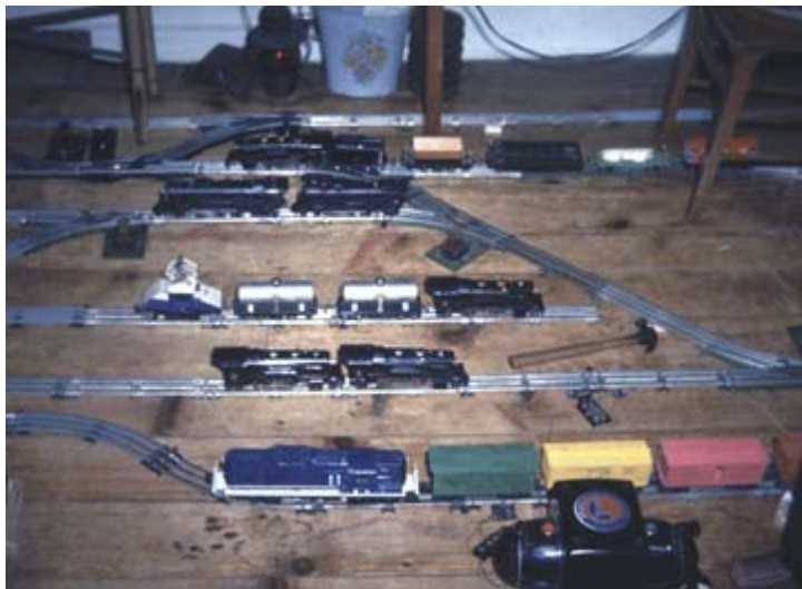
Buffalo Creek Railroad, Circa 1965