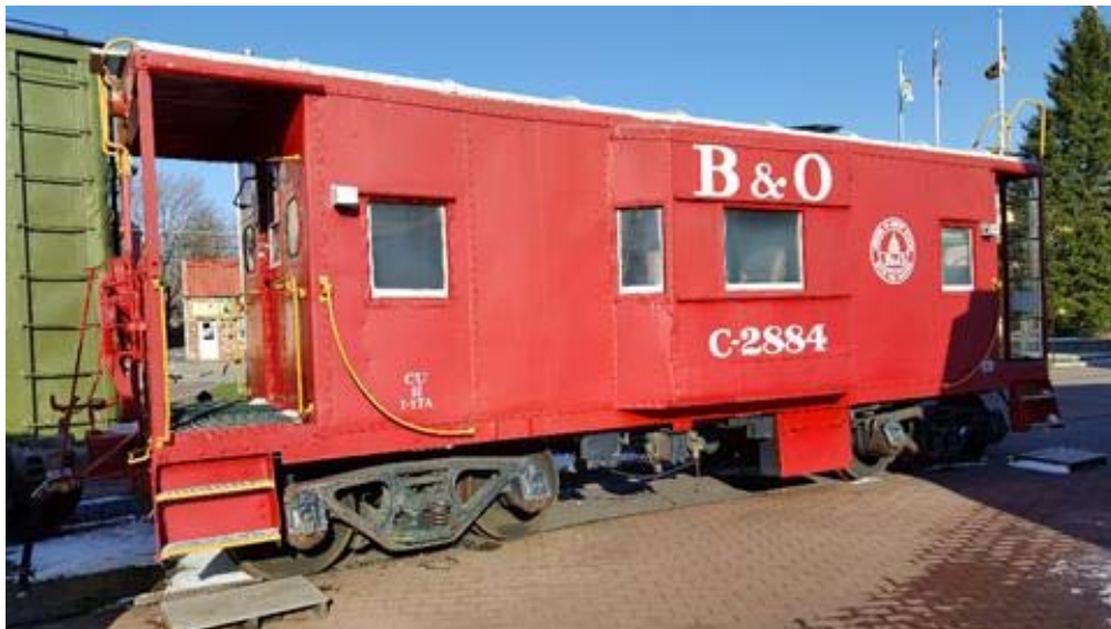
B&O Bay Window Caboose

Caboose cupola height couldn't be raised further due to tunnel height restrictions. Hence the introduction of the bay window caboose shown below. Bay windows allowed observation of the cars without raising the caboose height. The B&O was an early adapter of bay window cabooses.