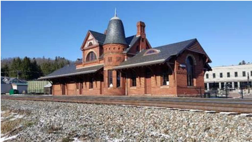
Oakland Maryland B&O Railroad Station - trackside

The station was built by the B&O Railroad in 1884 replacing a station that burnt down. Closer look at the restored Oakland station revealed Victorian architecture reminiscent of Point of Rocks but smaller in size and architectural flourish. The similarity is no coincidence as the architect for both stations is E. Francis Baldwin, architect for many B&O structures.