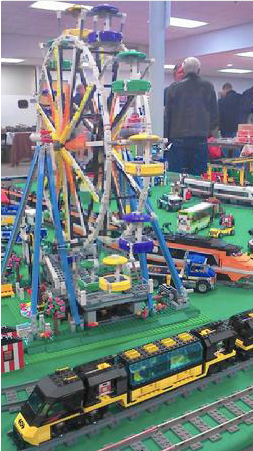
A model train display you might see at Annapolis' only Train Meet this Sunday, hosted by the WB&A Chapter of the Train Collectors Association, at the Annapolis Elks Lodge, 2 Pythian Drive, Edgewater.