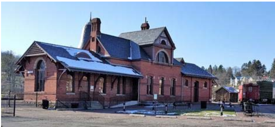
Oakland Maryland B&O Railroad Station – street side