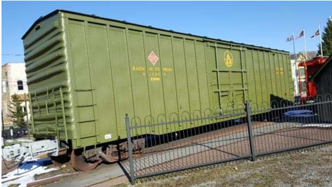
Railway Express Agency Box Car

Outside the station are two pieces of rolling stock that illustrate a cause and effect in caboose design. Older cabooses had cupolas to allow crew to observe the other cars in the train. When freight cars got taller, such as the Railway Express Agency car shown below, the view from the cupola was blocked by the taller freight car.