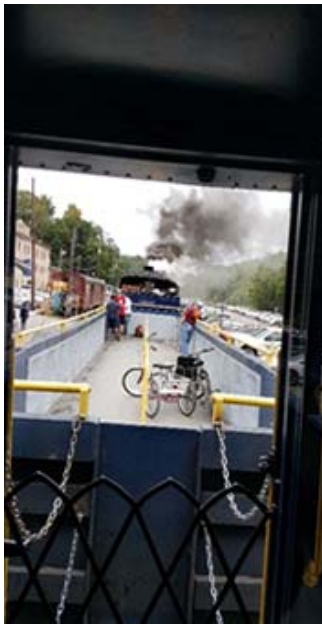
View of gondola car with bicycles