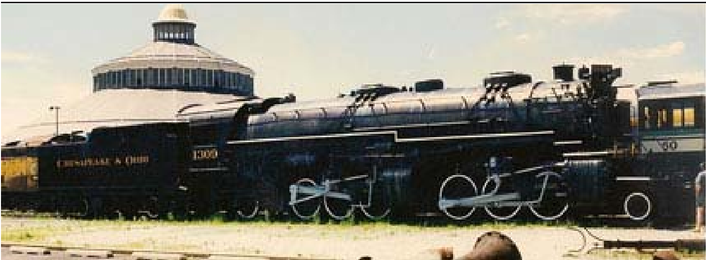
From the August 2017 Potomac Rail News:

A couple of other pieces were displayed to help all members discern if the work was fako.