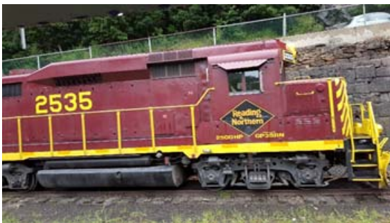
Reading & Northern diesel

This trackage is part of the parent rail line, Reading Blue Mountain & Northern (a.k.a. Reading and Northern RR) which runs freight in several eastern Pennsylvania counties. Some of their rolling stock could be seen on sidings.