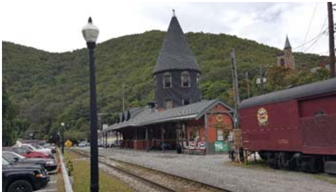
Rail station in Jim Thorpe

The Town of Jim Thorpe is known as the "Switzerland of America" as it is nestled between mountains. The rail station was built in 1888 in the Queen Anne style (like Point of Rocks). The town has several attractions, restaurants, and activities. In the 19th century the town would see over 30,000 visitors in a year. The other source of wealth for the community was coal; the town is located in Carbon County.