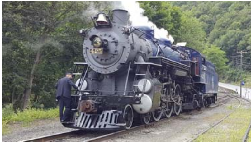
425 Pacific type engine

We were looking at several possible destinations but the LGSR was running steam that weekend and was the deciding factor. We were not disappointed.