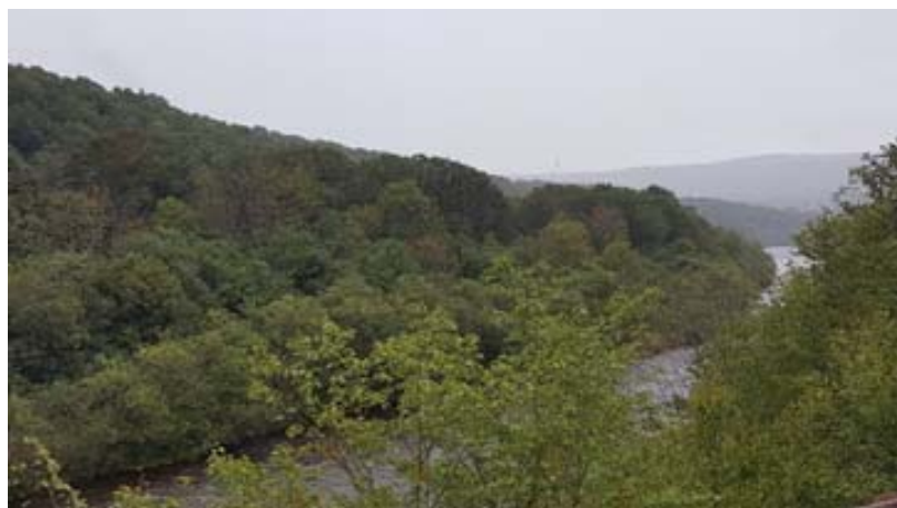
Breathtaking Views of the Lehigh River

The 16-mile roundtrip route takes us into beautiful Lehigh Gorge State Park. A bicycle/hiking trail parallels the tracks and the Lehigh River. This is beautiful scenery. The LGSR offer several Autumn Leaf Excursion tours and am planning on taking one in October.