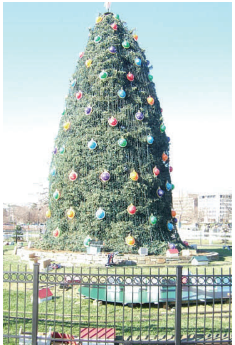
National Christmas Tree

I truly love this activity of setting up the trains for our National Capital.