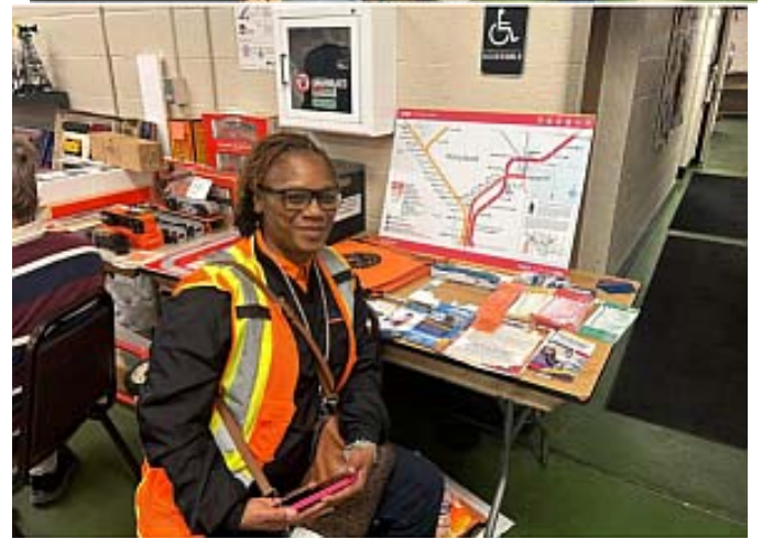
A representative of MARC was also present.