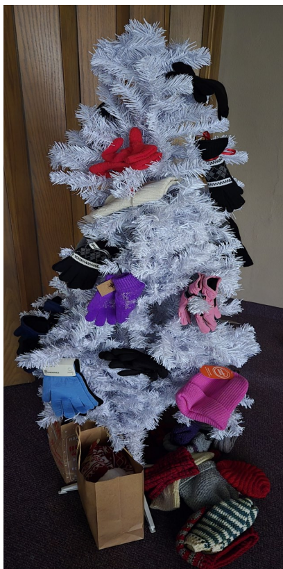
THANK YOU to all who donated to the HUGSS tree!