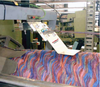
Typical DRYCOM On-Line Dryer Moisture Control Applications