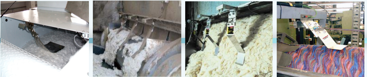
Typical DRYCOM On-Line Dryer Moisture Control Applications

These systems continuously monitor the moisture content of the product exiting the dryer and regulate the flow of energy (gas or steam) into the dryer to ensure the moisture content is maintained at the desired level.