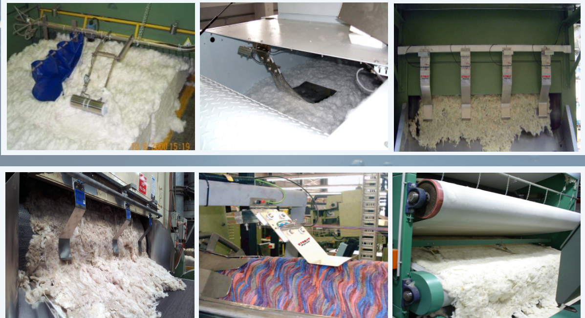
Typical DRYCOM on-line Moisture Measurement Applications

Virtually any product capable of retaining moisture can be measured using a DRYCOM Moisture Meter.